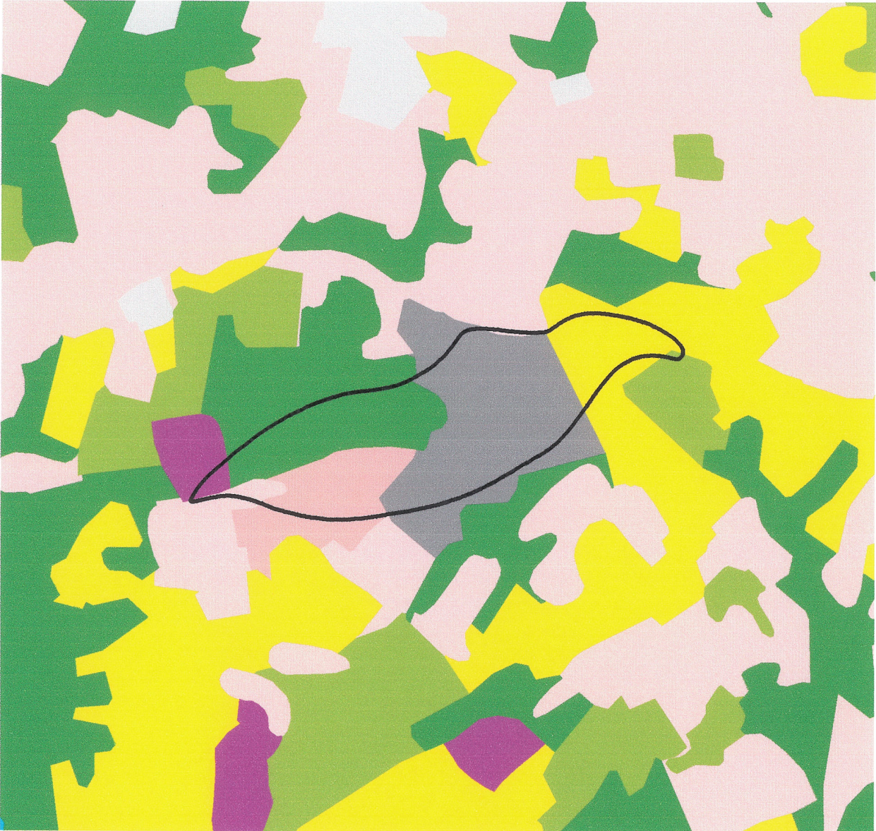
Figure 2. Land Use in the Sunnybrook Wellhead Protection Area.