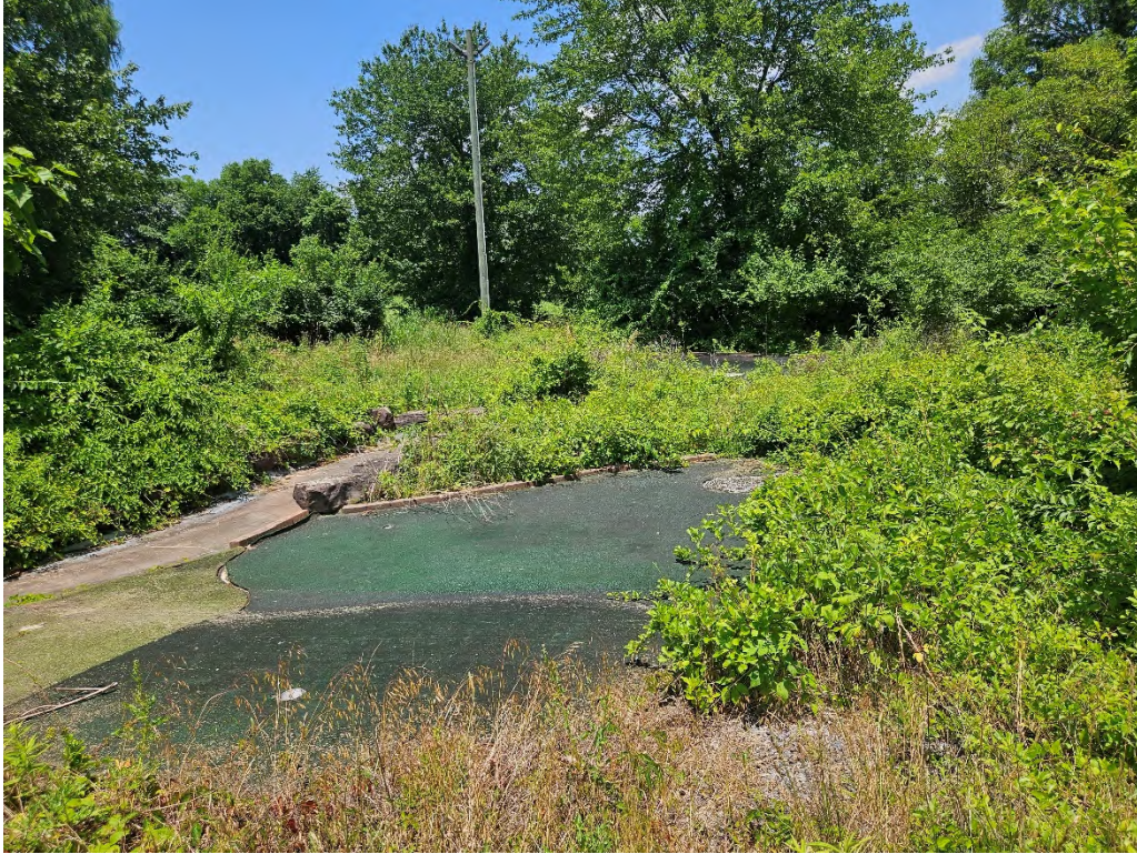
Photo 17 Ruins of miniature golf complex located north of driving range building complex, looking north