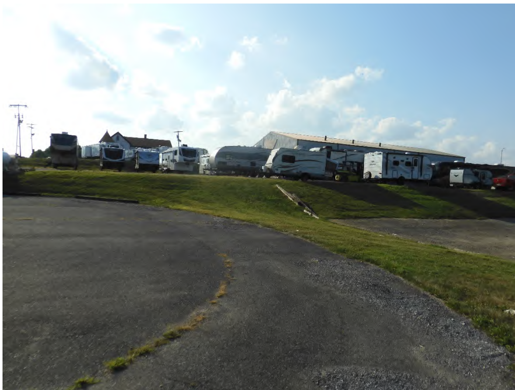
Photo 37 Mercer-Todd Farm (MIHP F-3-053) and surrounding complex, looking northwest (Goodwin 7/23/2025)