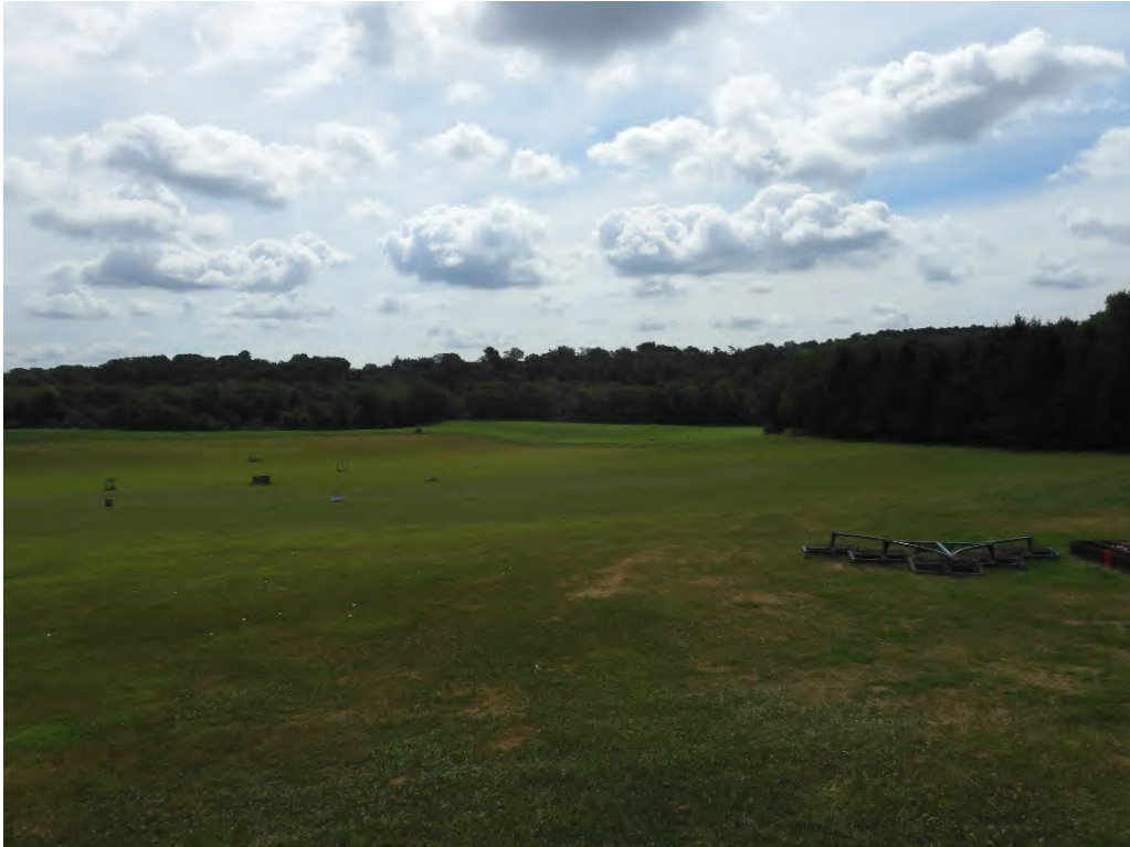
Photo 2 Overview of Monocacy Battlefield (MIHP F-3-42) from driving range building on north-south ridge north of Reich's farm, looking east across floodplain landscape toward Monocacy River (center) and tree line along southern edge of property (Goodwin 7/21/2025)