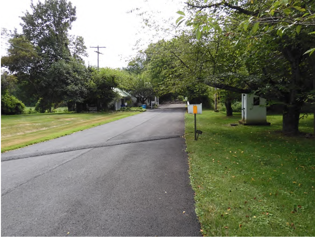
Photo 25 Frederick-Baltimore Turnpike (MIHP F-3-224) road alignment approaching the Jug Bridge with Jug Bridge Tollhouse (MIHP F-3-128), looking east (Goodwin 7/21/2025)