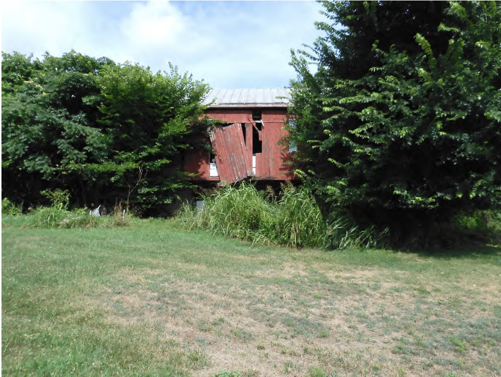
Photo 5 Detail of east elevation of Reich bank barn (MIHP F-3-252), looking west (Goodwin 7/21/2025)