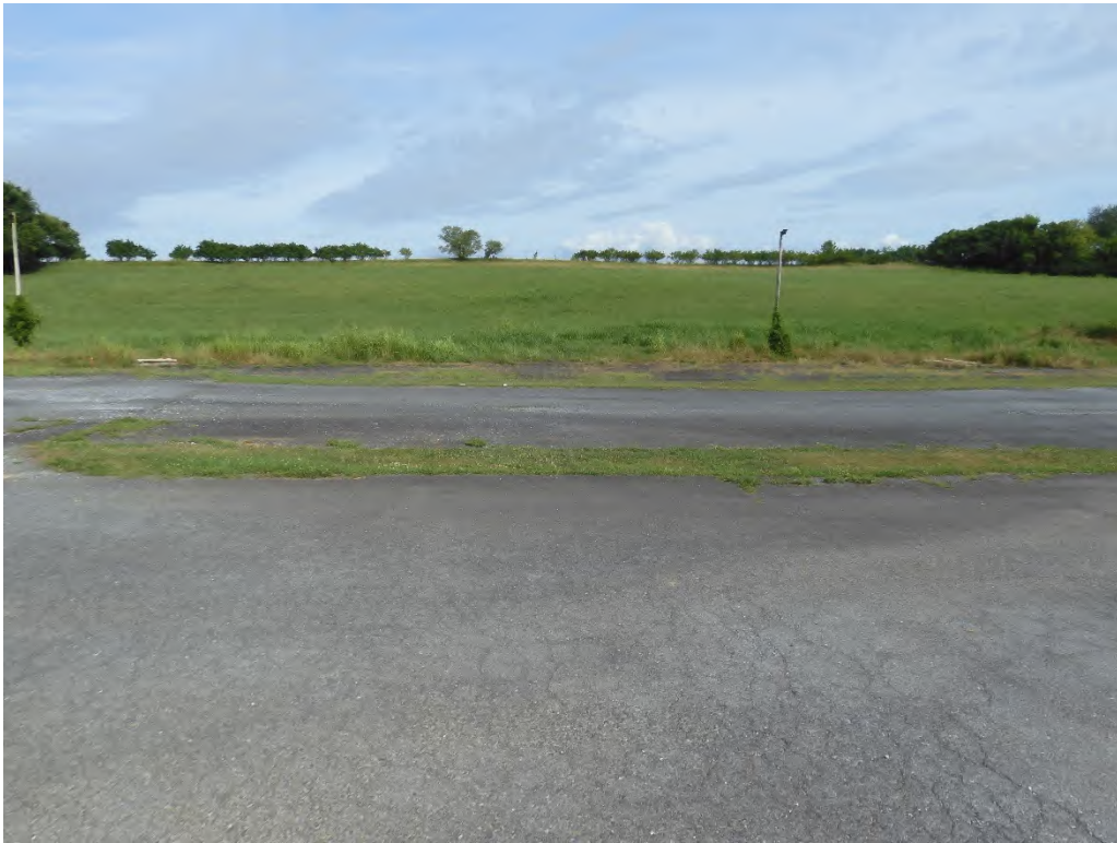
Photo 18 Higher ridge at western edge of property west of the barns and driving range complex and east of the Mercer-Todd Farm (MIHP F-3-053), looking west from I-70 golf parking lot (Goodwin 7/21/2025)