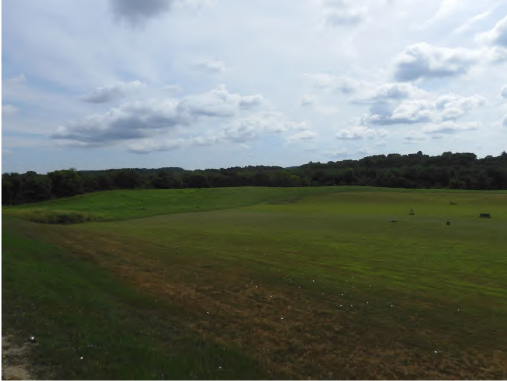
Photo 1 Overview of Monocacy Battlefield (MIHP F-3-42) from driving range building on north-south ridge north of Reich's farm, looking north-northeast across floodplain landscape toward Monocacy River (Goodwin 7/21/2025)