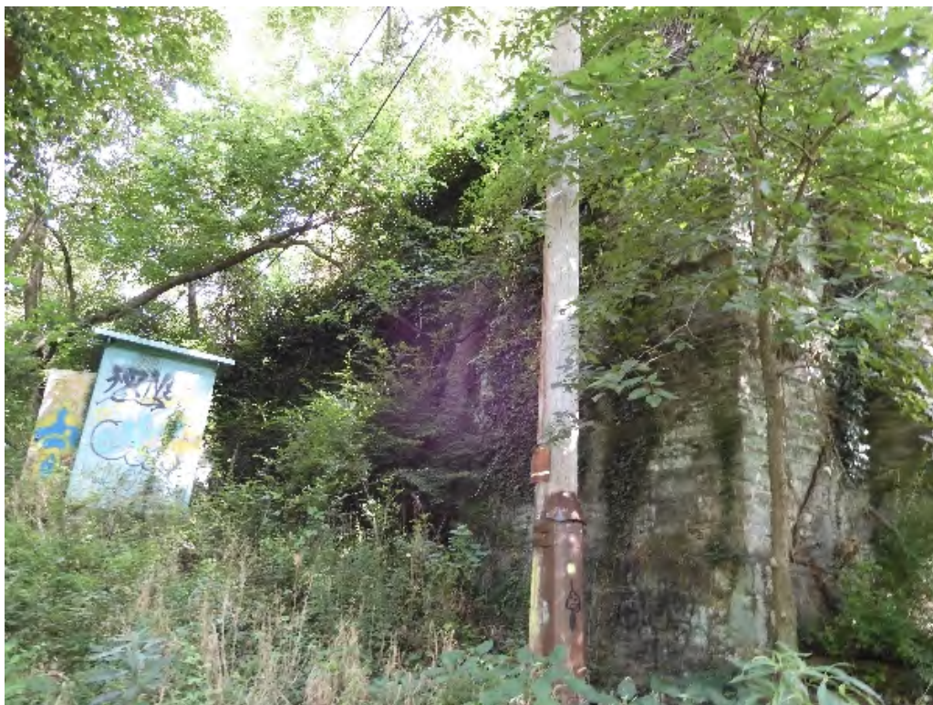
Photo 22 South side of Jug bridge ruins (MIHP F-3-128) on west bank of Monocacy River showing height of road bed above Monocacy River bank, looking northwest (Goodwin 7/21/2025)