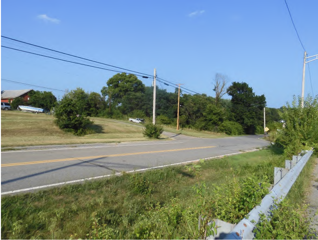
Photo 33 View toward project area from Current Rte 144, Old Rte 144 alignment, and Frederick Baltimore Turnpike at south end of the park and ride lot, looking northeast (Goodwin 7/23/2025)