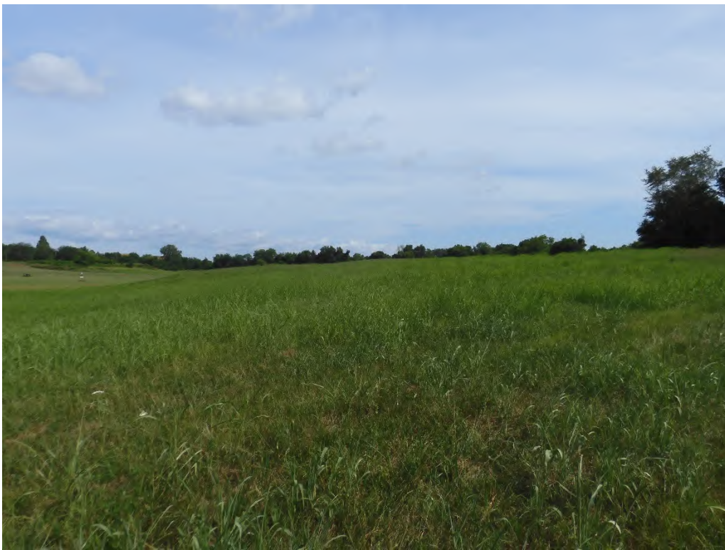
Photo 20 View from southeast corner of the property showing low ridge on west side of Monocacy River, looking north (Goodwin 7/21/2025)