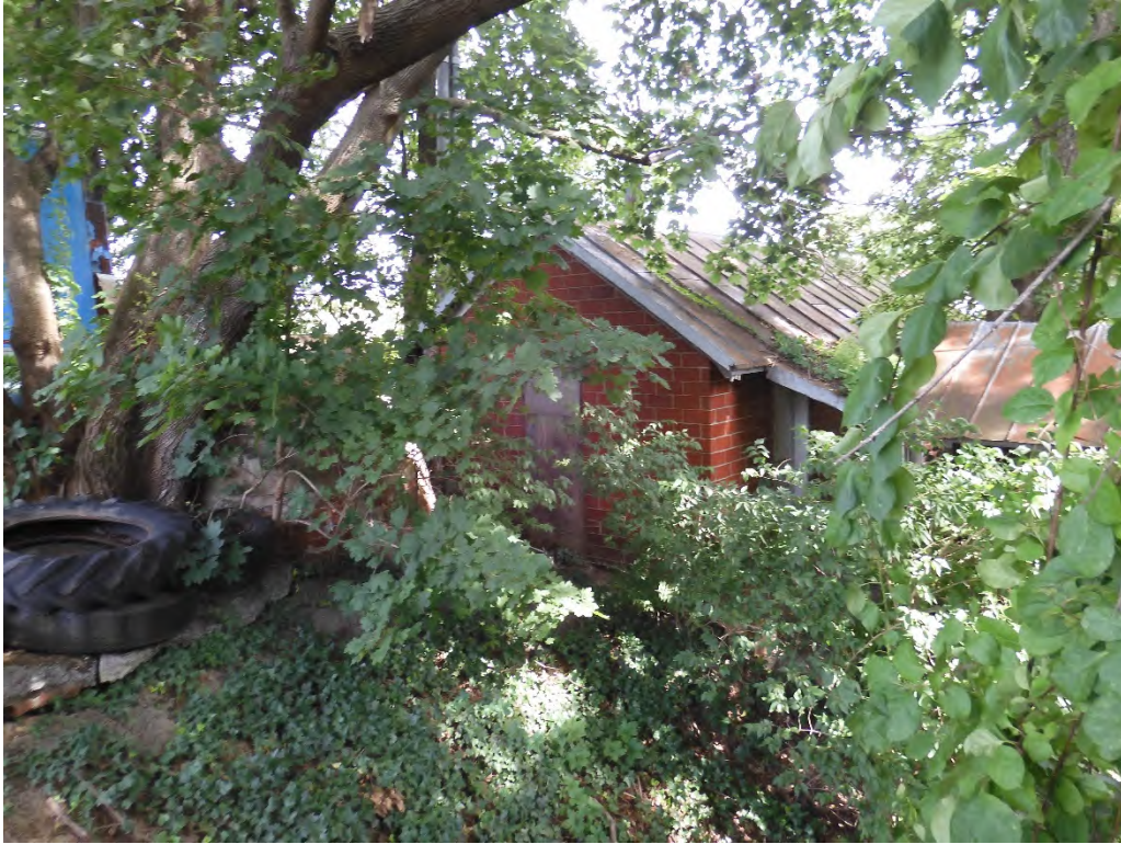
Photo 9 View of overgrown unidentified circular brick structure and south elevation of brick dairy looking north-northwest (Goodwin 7/21/2025)