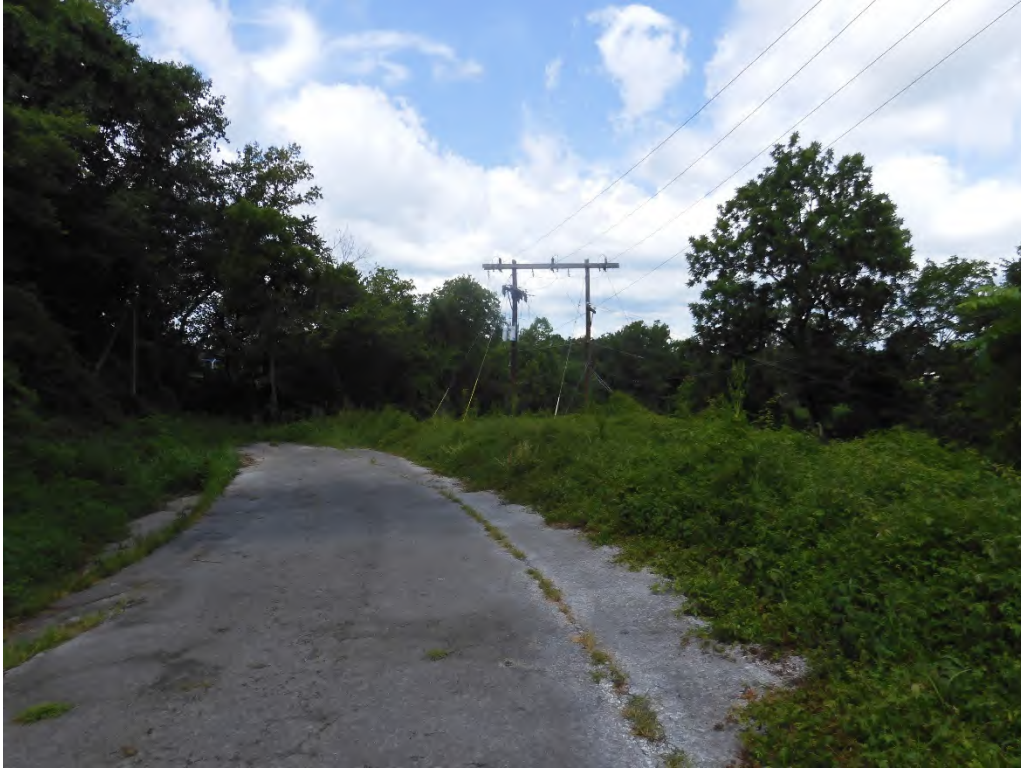
Photo 39 View along Dr. Baxter Road, which is the old Frederick-Baltimore Turnpike alignment on the east side of the Monocacy River, looking west (Goodwin 7/21/2025)