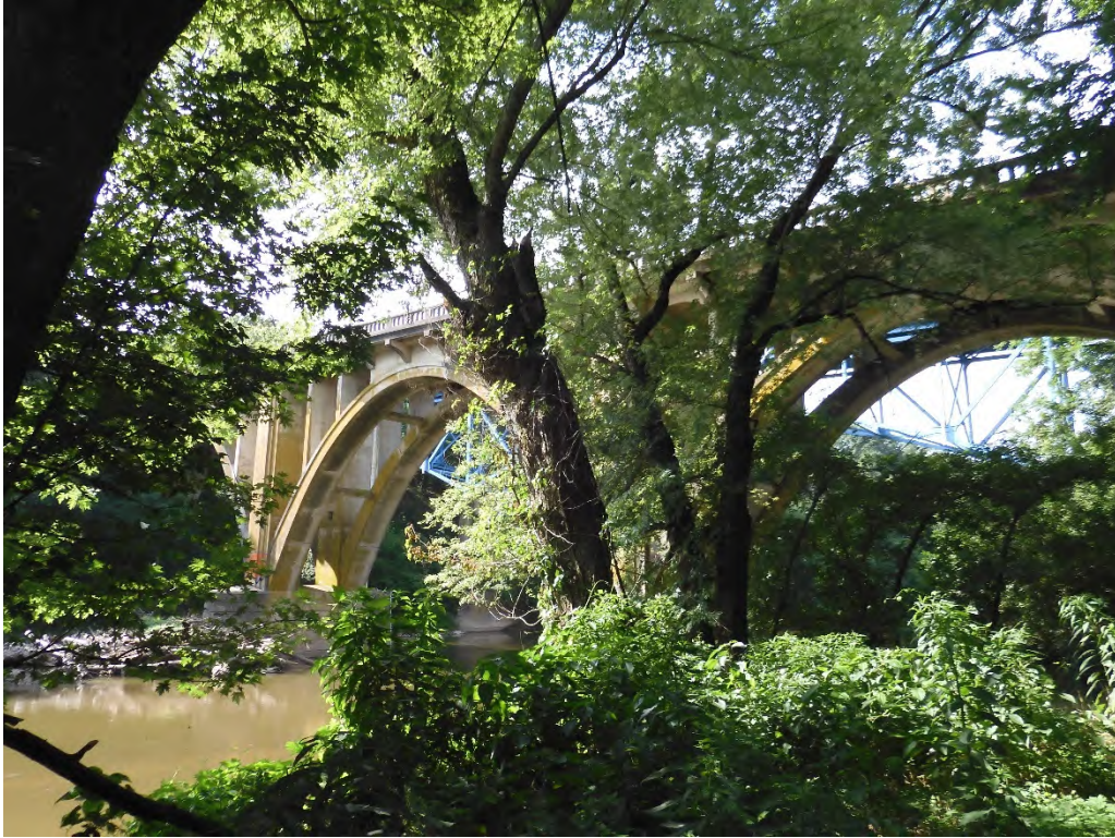
Photo 29 SHA Bridge No. 1003804 (MIHP F-3-251; F-3-224) Old Route 144 over Monocacy River, looking southeast