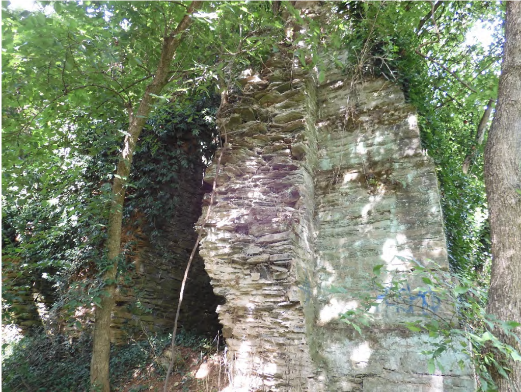
Photo 23 Jug bridge ruins (MIHP F-3-128) on west bank of Monocacy River, looking south-southwest (Goodwin 7/21/2025)