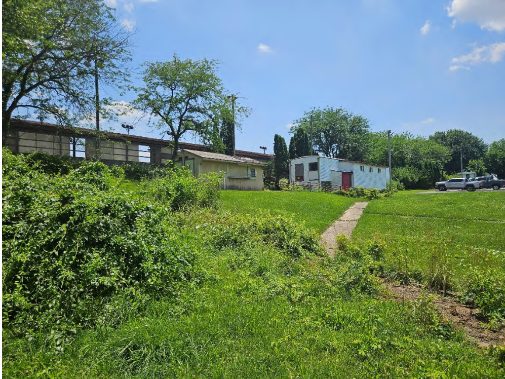
Photo 15 Driving range administration buildings west of driving range building, looking southeast (Goodwin 6/23/2025)