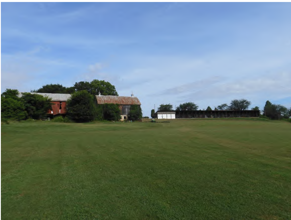
Photo 4 View of east elevation of Reich Farm barns (MIHP F-3-252) and driving range building occupying the north-south ridge, looking west (Goodwin 7/21/2025)