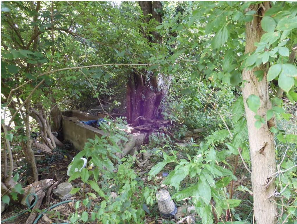
Photo 8 Site of mapped Philip Reich stone building (MIHP F-3-252) that is no longer extant, showing a concrete trough (Goodwin 7/21/2025)