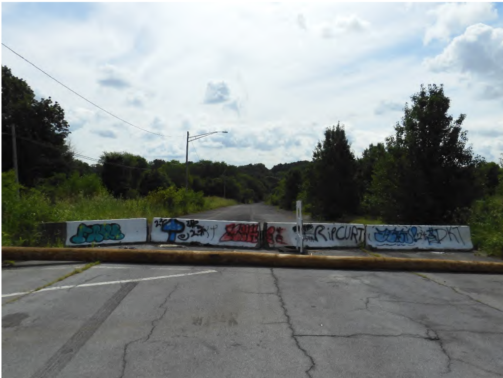
Photo 30 Old Route 144 alignment (MIHP F-3-224) to Monocacy River, looking east (Goodwin 7/21/2025)