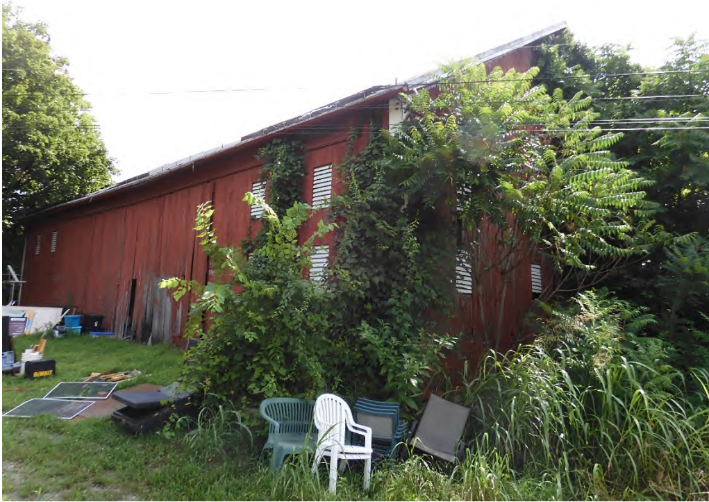
Photo 7 South and west elevations of Reich bank barn (MIHP F-3-252), looking northeast (Goodwin 7/21/2025)