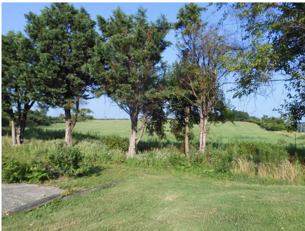
Photo 38 View from southeast corner of Mercer-Todd Farm (MIHP F-3-053) property toward project area showing ridge, looking northeast (Goodwin 7/23/2025)