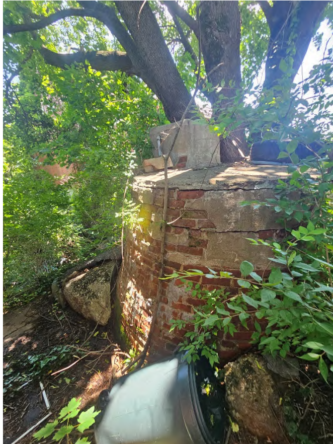
Photo 10 Detail view of unidentified circular brick structure, looking southeast (Goodwin 6/23/2025)