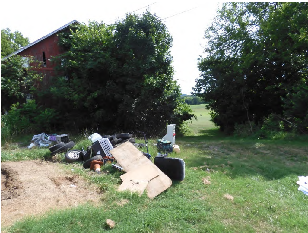
Photo 6 South elevation of Reich bank barn (MIHP F-3-252), looking northeast through gap in vegetation toward project area