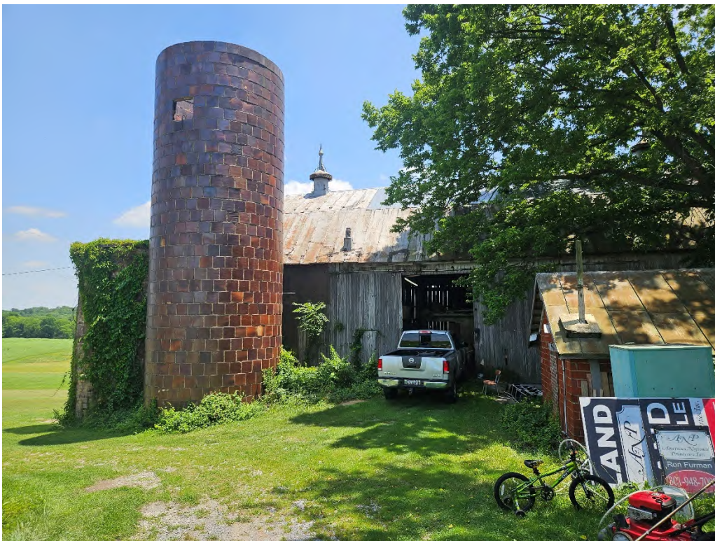
Photo 12 West elevation of gambrel roof dairy barn with silos to left of image and brick dairy to right of image, looking east (Goodwin 6/23/2025)