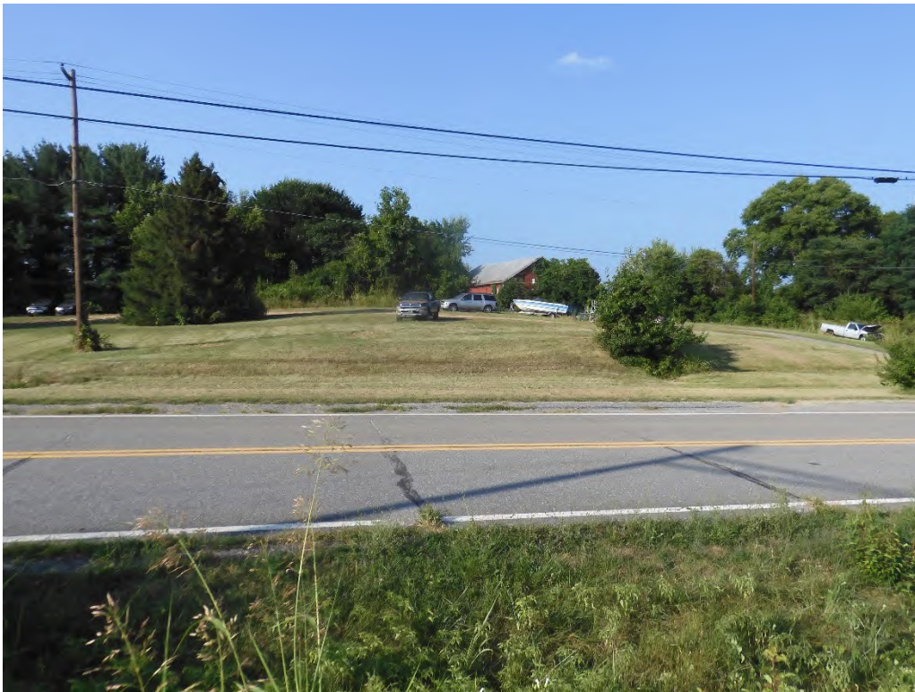
Photo 34 View of Philip Reich Farm/Benvenue Site (MIHP F-3-252), looking north with view toward project area in the right of image beyond the barns