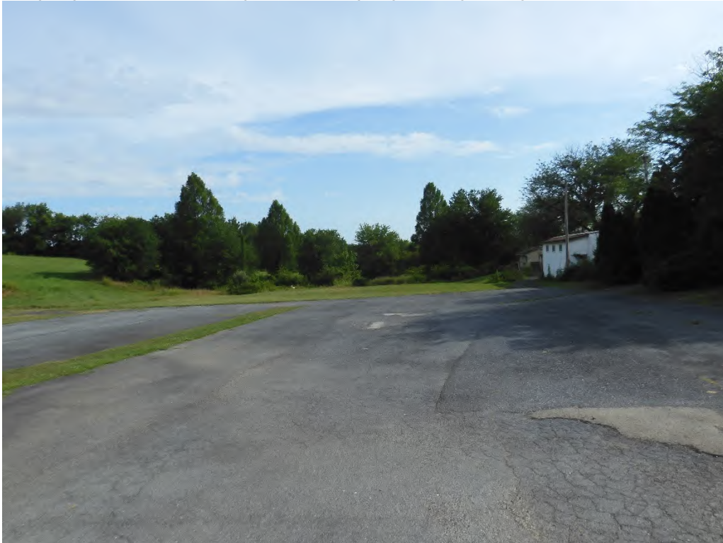
Photo 16 View toward former miniature golf area located north of parking lot, looking north (Goodwin 7/21/2025)