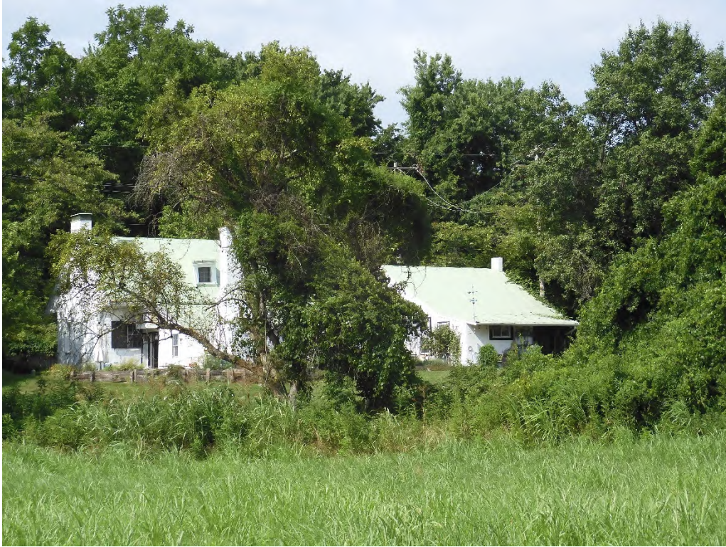
Photo 27 North (rear) elevation of Jug Bridge Tollhouse (MIHP F-3-128) taken from southeast corner of the project area, looking southwest (Goodwin 7/21/2025)