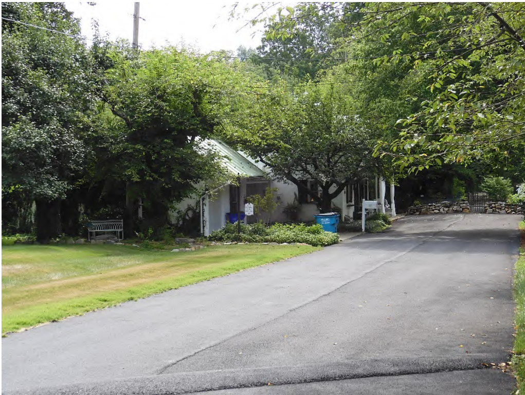
Photo 26 South elevation (front) of Jug Bridge Tollhouse (MIHP F-3-128), looking east (Goodwin 7/21/2025)