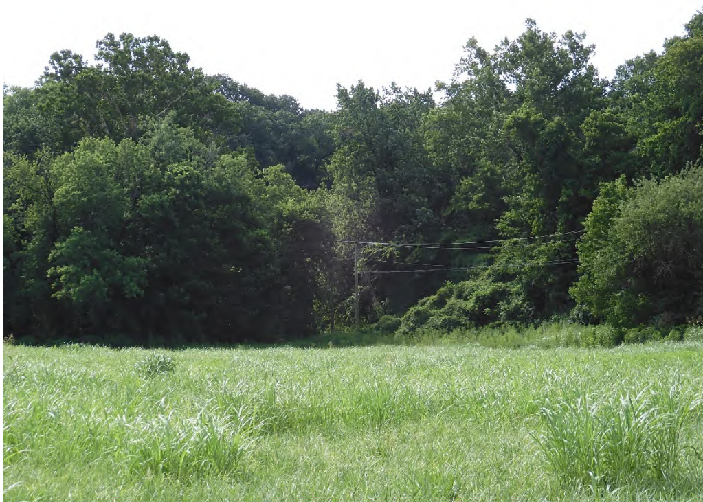
Photo 21 View of southeast corner of project property showing approach to Jug Bridge ruins (MIHP F-3-128), looking southeast (Goodwin 7/21/2025)