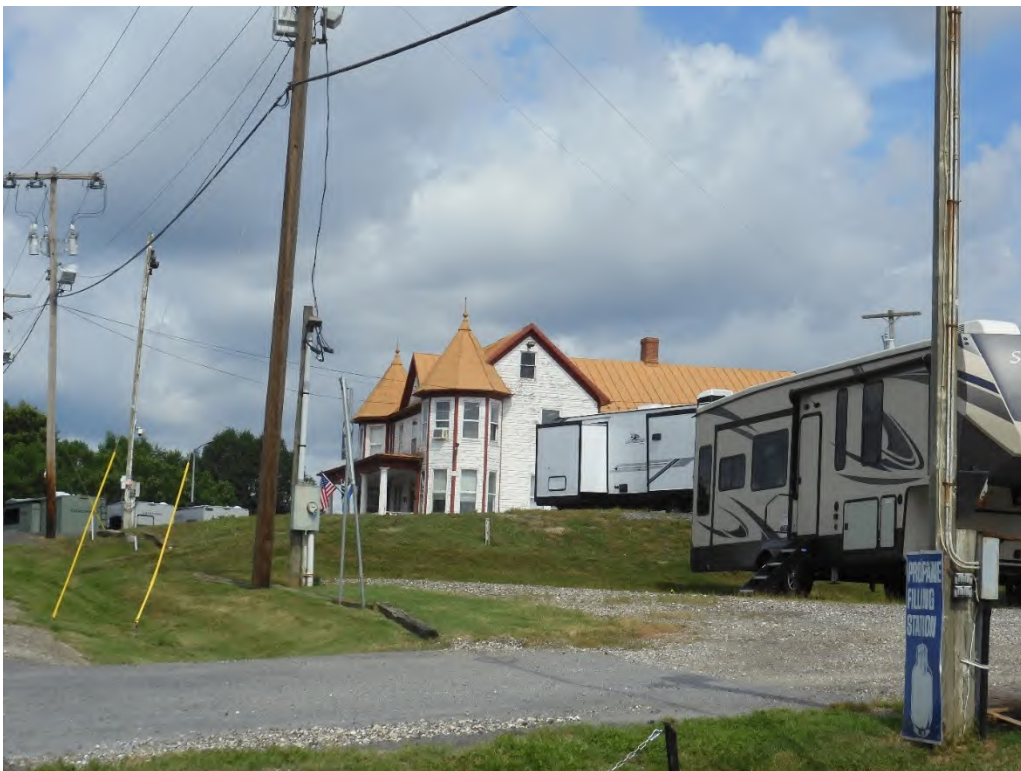
Photo 36 Mercer-Todd Farm (MIHP F-3-053), looking northwest (Goodwin 7/21/2025)