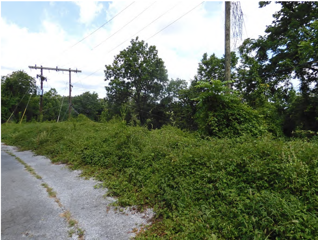
Photo 40 View toward project from along Dr. Baxter Road, which is the old Frederick-Baltimore Turnpike alignment (MIHP F-3-224) on the east side of the Monocacy River, looking northwest