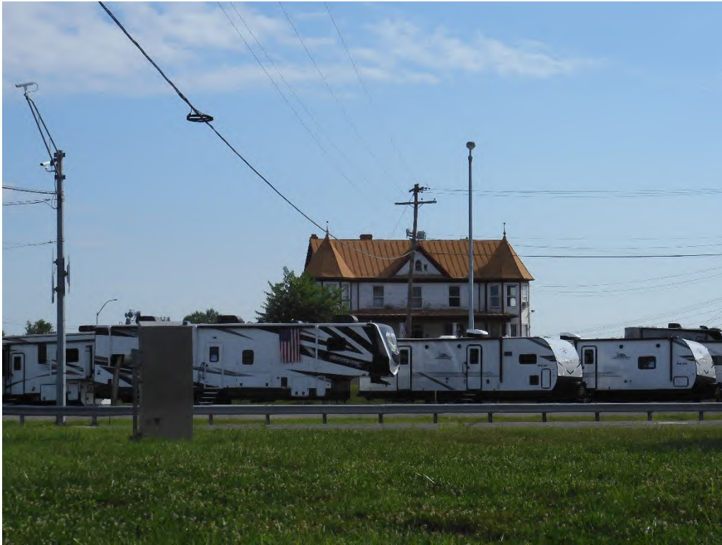
Photo 35 Mercer-Todd Farm (MIHP F-3-053) from corner of Legg and Orchard Quinn Roads, looking north (Goodwin 7/21/2025).