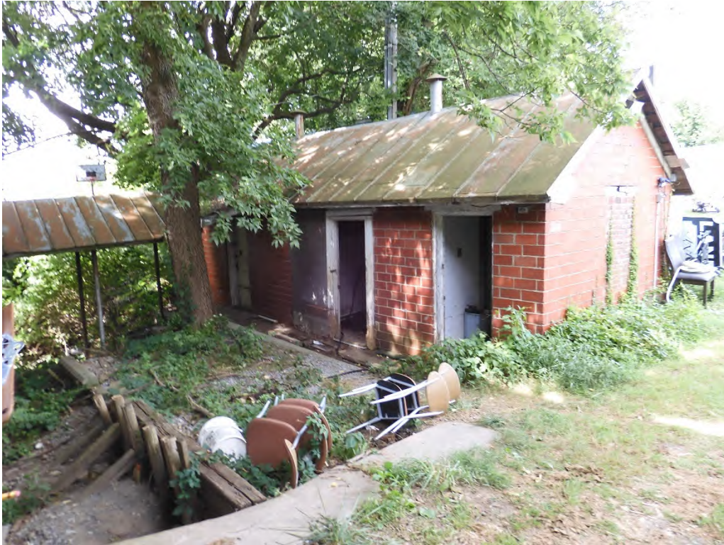
Photo 11 View of east and north elevations of brick dairy and covered walkway, looking south-southwest (Goodwin 7/21/2025)