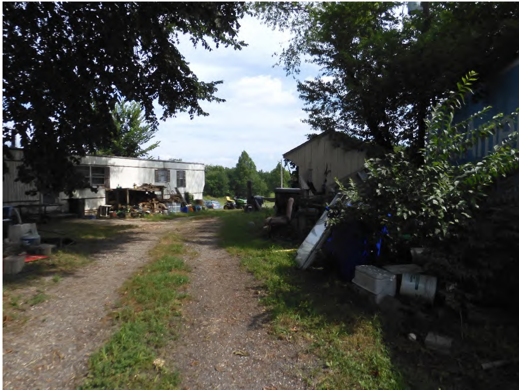
Photo 14 Trailer and shed west of barn complex, looking north-northwest (Goodwin 7/21/2025)