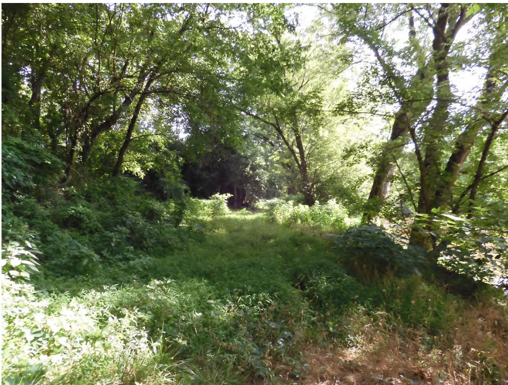
Photo 24 View from Jug Bridge ruins, looking north along Monocacy River (Goodwin 7/21/2025)