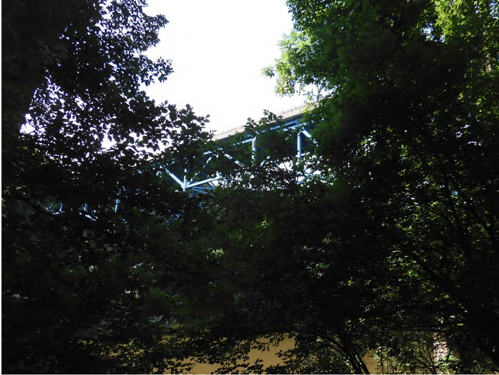
Photo 31 MDOT SHA Bridge No. 1003800 (MIHP F-3-205; F-3-224) Current Route 144 over Monocacy River, looking southeast (Goodwin 7/21/2025)