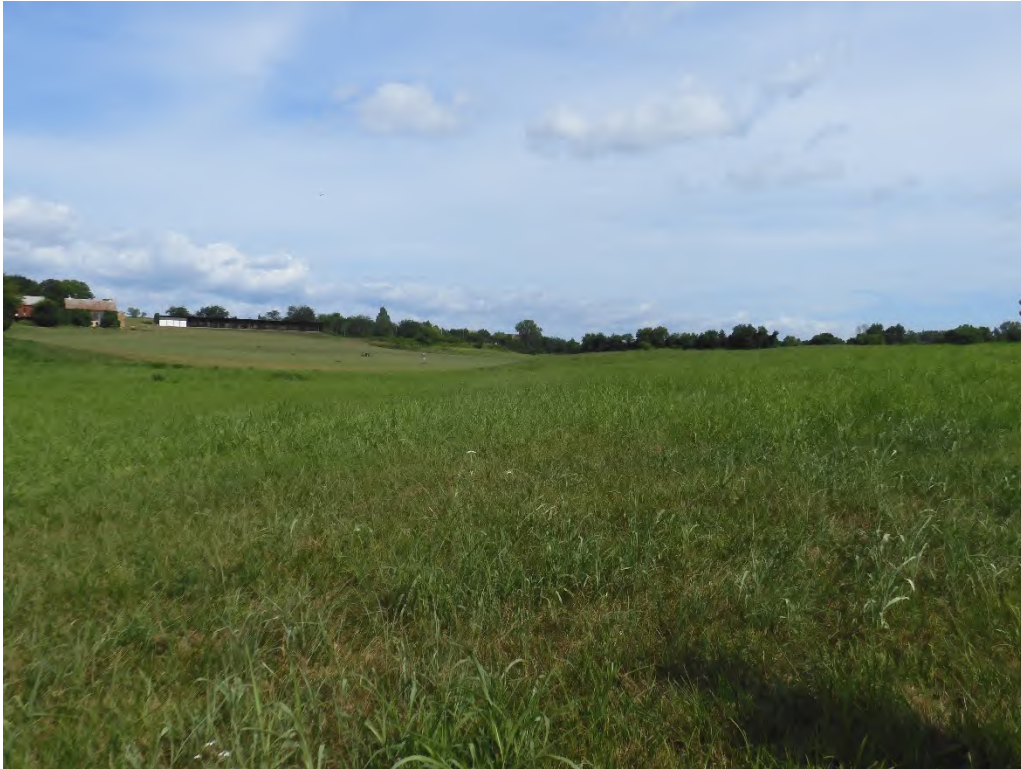
Photo 19 View from southeast corner of the property toward driving range buildings, looking west (Goodwin 7/21/2025)