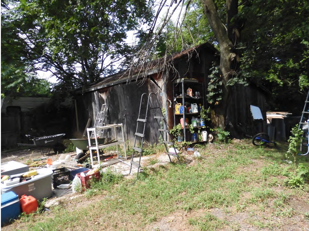
Photo 13 North and east elevations of equipment shed, looking southwest (Goodwin 7/21/2025)