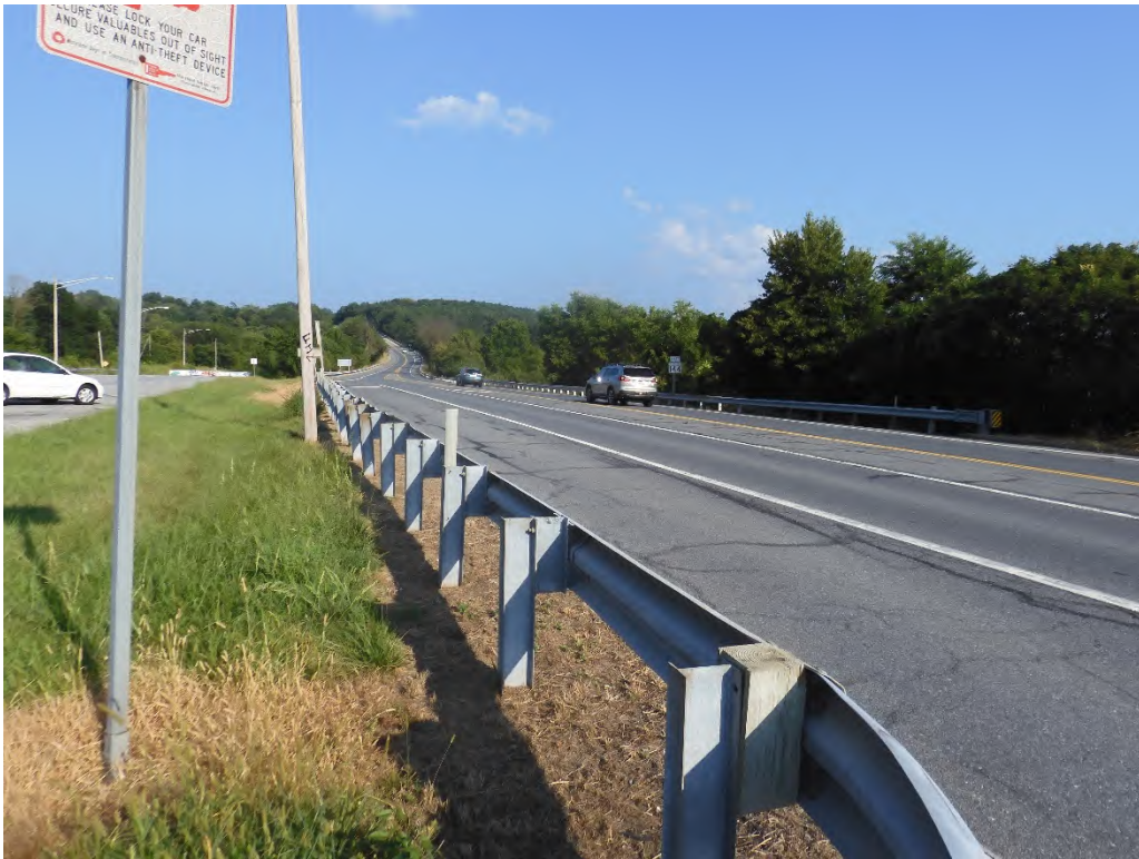
Photo 32 Current Route 144 over Monocacy River, looking southeast (Goodwin 7/21/2025)