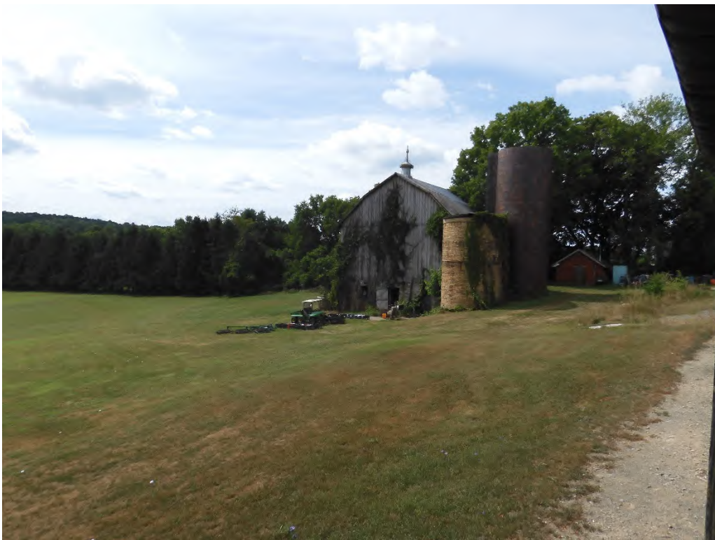
Photo 3 View of north and west elevations of gambrel roof barn and silos of Philip Reich farm (MIHP F-3-252) from driving range building on north-south ridge, looking southeast showing tree line along southern edge of property (Goodwin 7/21/2025)