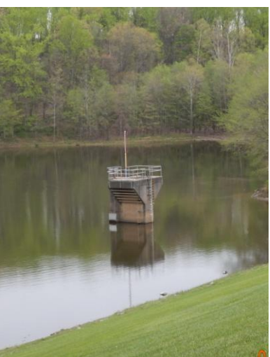
Maryland Department of the Environment, Water and Science Administration, Dam Safety Division 1800 Washington Boulevard, Suite 440 Baltimore, Maryland 21230