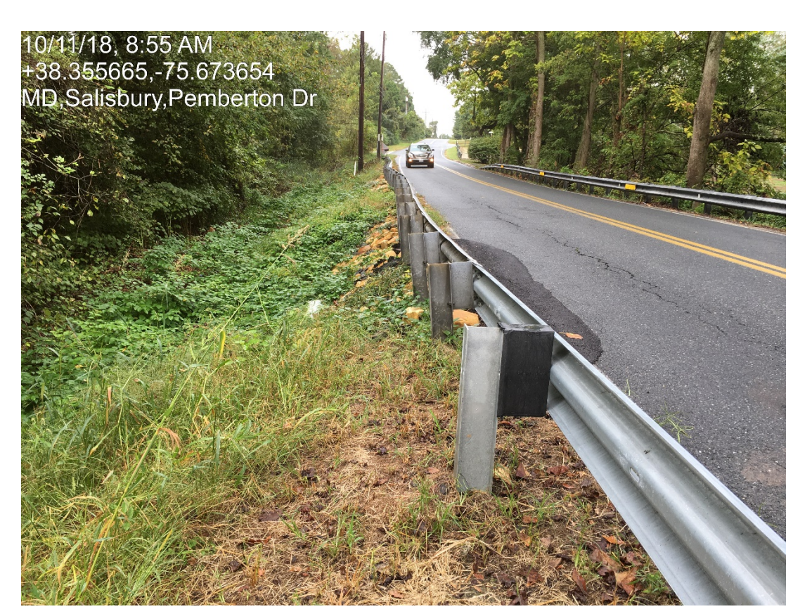
Anderson Mill Pond, Salisbury, MD.