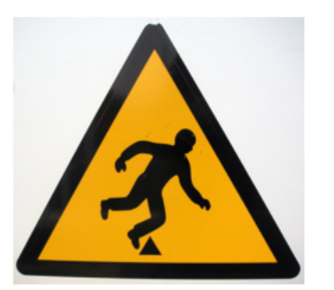
"Tripping Hazard" by World of Oddy is licensed under CC BY-NC-SA 2.0.