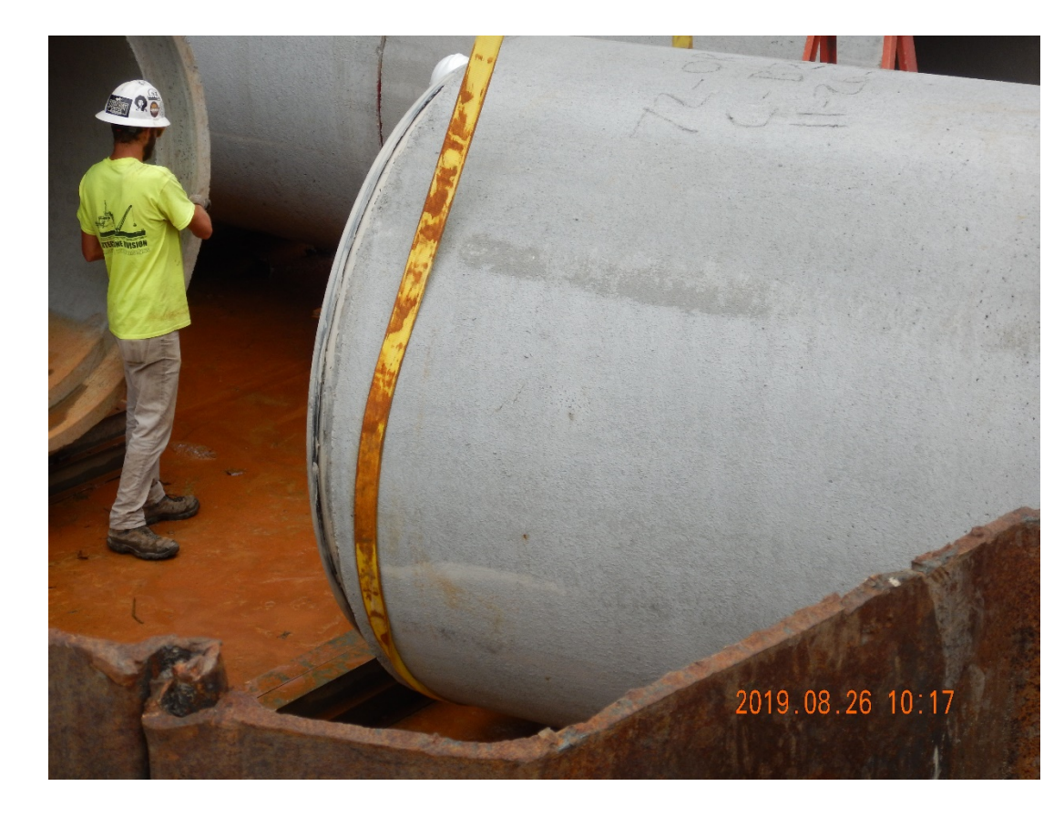
Morris Mill Dam, Salisbury, MD.