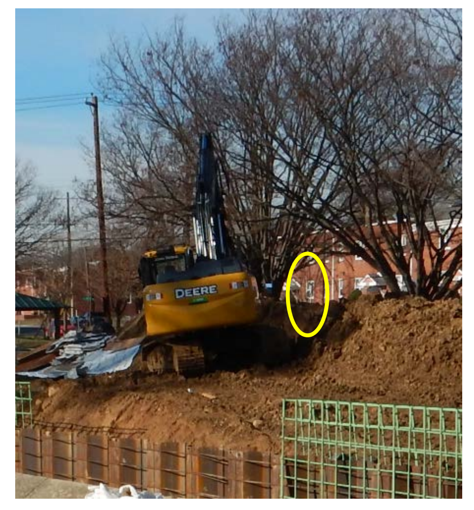
Allison Street Levee, Prince George's County, MD.