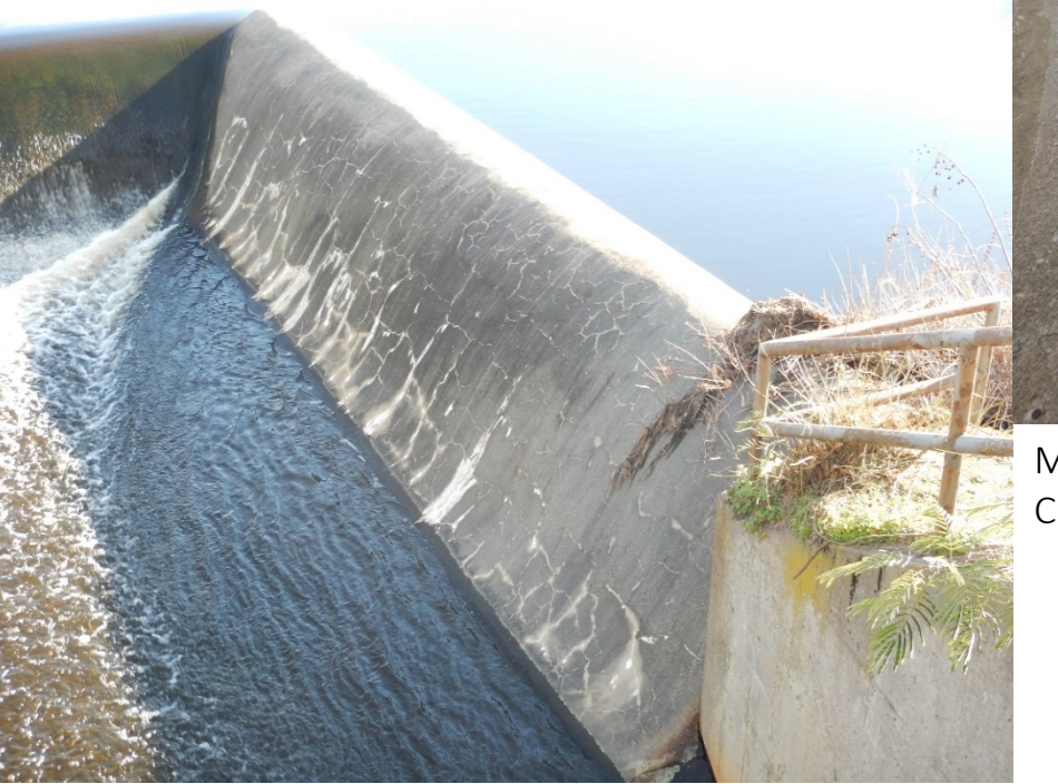
Beaglin Park Dam, Salisbury, MD.