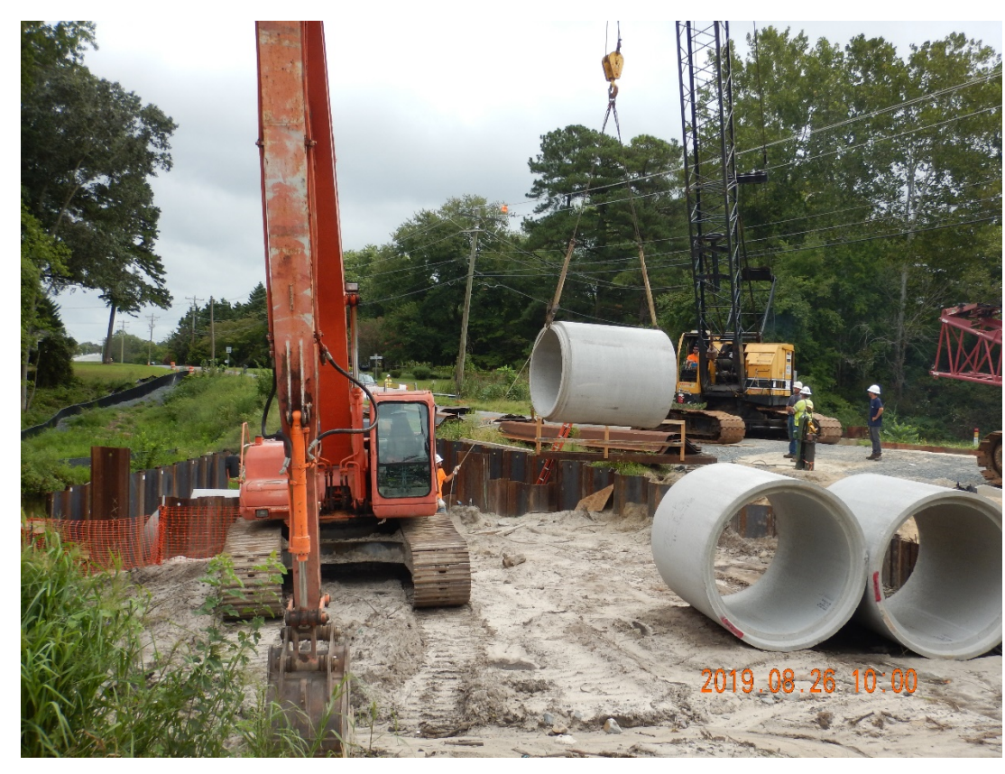
Morris Mill Dam, Salisbury, MD.