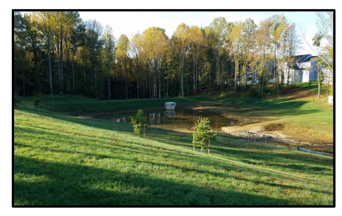
2020 Conversion of an E&SC pond to SWM, Prince George's County, MD.