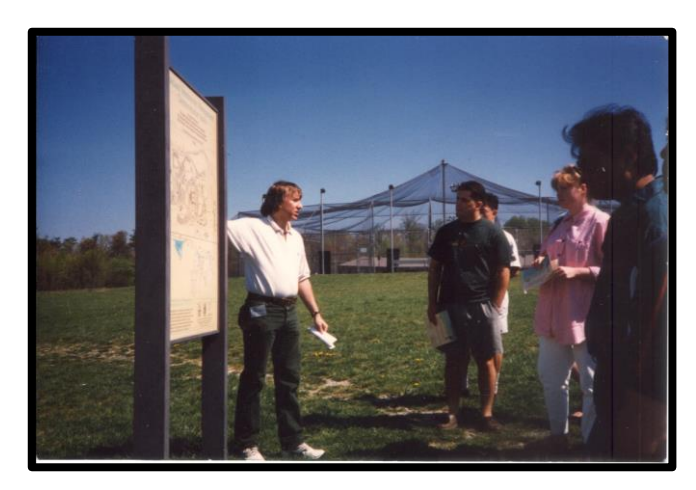
Fairland Park Demonstration Project, Prince George's County, circa 1990s