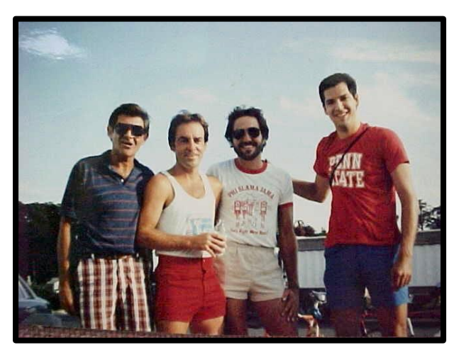
Chestertown Conferences, Kent County, Circa 1980s