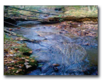
Figure 26. One of the in situ jute particle collection mats