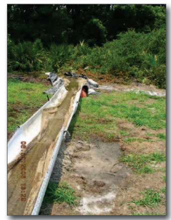
Figure 20. Split pipe with polymer blocks