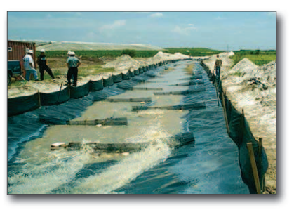
Figure 16. Flocculation ditch with checks to increase the polymer mixing

The treatment ditch used to clarify stormwater runoff from a highway construction site (Figure 17) has deeply corrugated sides that create turbulence which facilitates flocculation by mixing the polymer flocculant with the turbid stormwater. The ditch is made of high density polyethylene (HDPE) sections that can be disassembled and reused on other projects or recycled. These sections eliminate the need for the hay bales and plastic linings, they reduce the amount of construction material taken to municipal landfills for disposal, they will stack tightly for transporting to another job site or storage, and they can also be