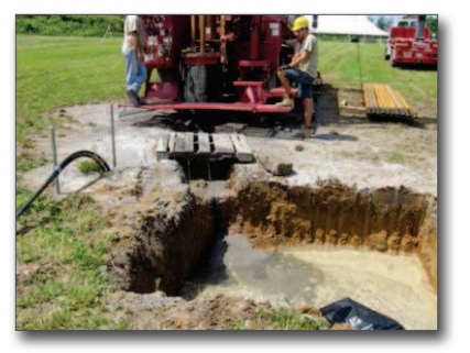
Figure 7. Drilling rig and settling pit

conditioning systems, the water discharged from the drilling operations can be laden with rock chips and sediment and is often toxic. A drilling rig and its settling pit that allows larger particles from the rig's discharge to settle out is shown in