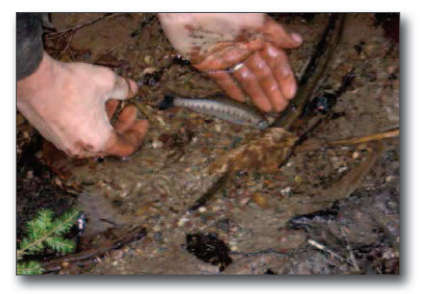
Figure 27. Salmon smolt swimming in the diversion ditch

spawning adults could be seen swimming in these waters. To protect the habitat, it was important to have this flocculation system in place before the construction project began.