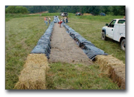
Figure 15. Lower portion of the treatment ditch