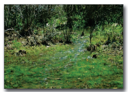
Figure 10. Clarified dredge spoils returning back to the lake

into a Tennessee Valley Authority lake. The dredge spoils were initially pumped into a settling pond to allow the heaver particles to settle. Then after passing through the mixing ditch in Figure 8, they entered an 8,100 square foot dispersion field (Figure 9) lined with jute matting, which was covered with a powdered polymer flocculant. After passing over a dispersion field and through a sediment retention barrier, the clarified water was returned to Kentucky Lake (Figure 10). The dredge spoils pumped into the settling pond were 15% solids. After settling, the water discharged from the settling pond had a turbidity ranging from 500 to 600 NTUs. And after flocculation in the treatment ditch followed by additional