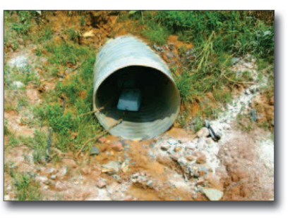
Figure 39. Polymer block in a construction site culvert