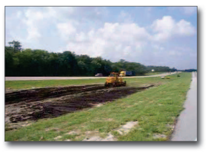
Figure 37. Recycling sediment along a highway