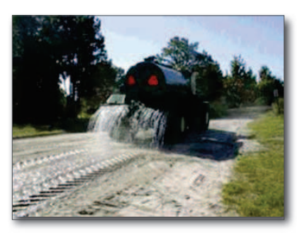
Figure 11. Water truck applying dissolved polymer flocculant

Dust control . The objective of dust control is to reduce airborne dust from haul roads, tailings piles, waste dumps, and open areas on construction sites. The polymer is mixed and dissolved in water and then sprayed directly on the road or other ground surface (Figure 11). A comparison