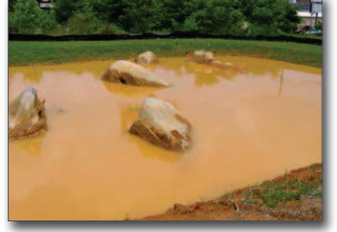
Figure 40. Sediment pond before BMPs were installed