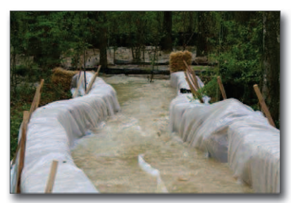
Figure 8. Large mixing ditch

A much larger dispersion field was needed to clarify the spoils from a dredging operation before they were discharged back