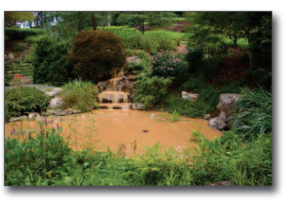
Figure 31. Newly constructed water garden

basins . When settling ponds or basins need to be dewatered, the water can be pumped through a sediment bag, which traps the coarse sediment