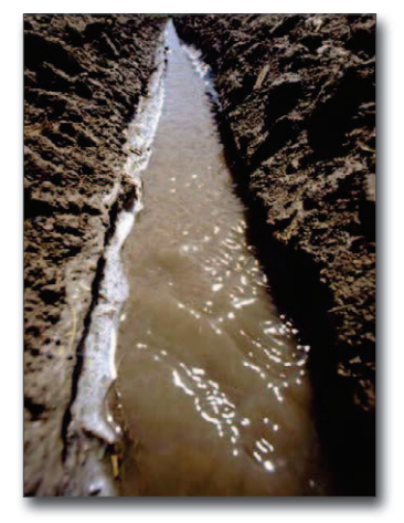
Figure 23. Untreated furrow with erosion