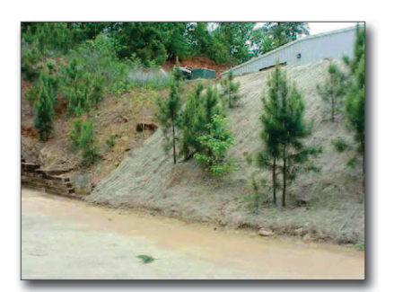
Figure 4. Slope covered with floc collection matting

of wind or water and to promote revegetation following a soil disturbing activity such as construction. Soft matting can be applied over the ground (Figure 4) to provide an attachment surface for floc collection as runoff flows down the slope. If hydroseeding is used, the addition of a polymer flocculant in liquid form to the hydroseeding mix will bind the seed. fertilizer. and other additives to the soil until the new vegetation is established. The hydroseeding mix is then sprayed on the slope (Figure 5), and vegetation is established to stabilize the slope (Figure 6). When hydroseeding is not used, the powdered polymer can be applied by hand over the matting. When it rains, the powdered polymer dissolves and the soil particles become