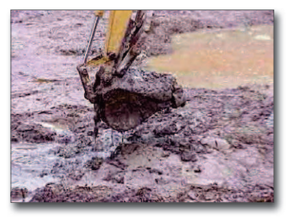
Figure 36. Removing stiffened sediment from a sediment basin

sediment will bind the particles together and stiffen it, making it easier to remove (Figure 36). This is done by spreading the granular PAM flocculant evenly over the sediment surface and then mixing it into the top three feet of sediment using the excavator equipment's bucket. Do not dump the flocculant in a pile. If the sediment is deeper than three feet, this mixing and removal can be repeated for each successive threefoot layer of sediment. The sediments removed may be recycled as topsoil (Figure 37).