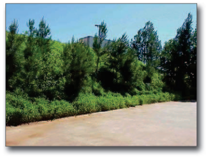
Figure 6. Stabilization four weeks later

chemically bound to the long polymer molecules. The resulting flocs are sticky and adhere to the fibers of the soft matting to create a highly erosion resistant surface that supports vegetation. If straw or mulch is used instead of soft matting to cover the ground, the flocs will also adhere to either of them and provide good erosion resistance and revegetation support.