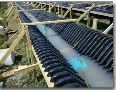
Figure 17. HDPE treatment ditch liner