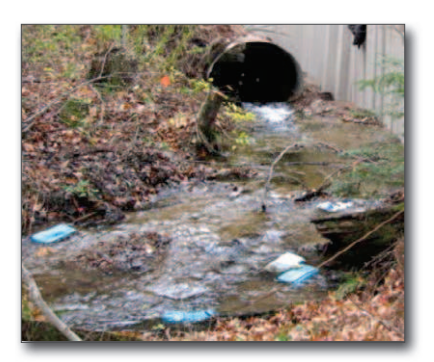
Figure 25. Six of the polymer blocks placed downstream

to be replaced during a fall salmon run. Before this construction project began, water soluble, polymer flocculant blocks were placed in the river 20 to 30 feet downstream of the culvert (Figure 25) to protect the spawning ground from turbidity. Jute matting was placed downstream of the polymer blocks (Figure 26) to collect the flocculated soil particles. Before the old culvert could be removed, a channel had to be dug to divert the flow around the construction site. The diversion channel was lined with plastic and crushed limestone. which was covered with polymer powder to prevent white plumes of lime sediment from drifting downstream. This flocculation successfully clarified the water in the diversion channel and in the river below the construction site. Little salmon smolts (Figure 27) as well as