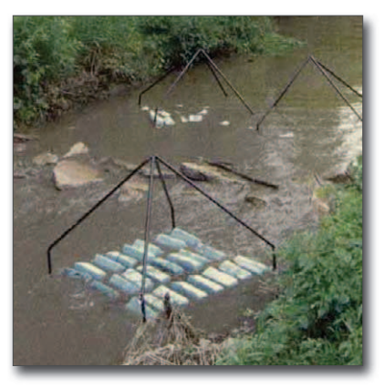
Figure 28. Three in-stream baskets

spawning adults could be seen swimming in these waters. To protect the habitat, it was important to have this flocculation system in place before the construction project began.