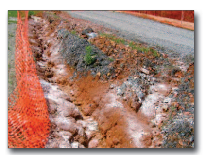
Figure 38. Eroding gully on a construction site

the site. Soluble polymer blocks were tethered inside a closed pipe (culvert) running under a construction road (Figure 39) that also drained to the pond. Before these BMPs were installed, the sediment pond was quite turbid (Figure 40). Two weeks after their installation and several significant rain events, the pond was clear, and only the sediment deltas remained (Figure 41). Designing polymer flocculation systems often involves using multiple BMPs and having them work well together.