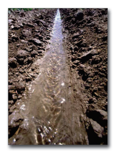
Figure 22. Furrow treated with PAM

roughness and infiltration reduce the furrow's erosion and sediment transport. Figure 22 shows a furrow treated with PAM having little erosion and clear water. Figure 23 shows an untreated furrow having erosion and cloudy water. Imhoff cones in Figure 24 compare the turbidity in these two furrows. The cone on the left holds water from the furrow treated with PAM; the cone on the right holds water from the untreated furrow.