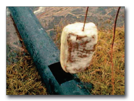
Figure 19. Polymer blocks inserted into pipes

construction site for a large number of homes near Disney World was drained because it was originally marsh land. The contractor pumped the water over a quarter of a mile through closed pipes to a natural lake. To prevent the lake from