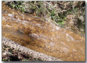
Figure 35. Clarified discharge water near the end of the treatment ditch

particles. Jute matting covered with powdered polyacrylamide flocculant placed under the sediment bag and along its discharge ditch (Figure 34) will clarify the discharge water by flocculating the fine sediment particles that pass through the bag and binding them to the soft matting. The discharged water in Figure 35 is much less turbid than the water leaving the sediment bag.