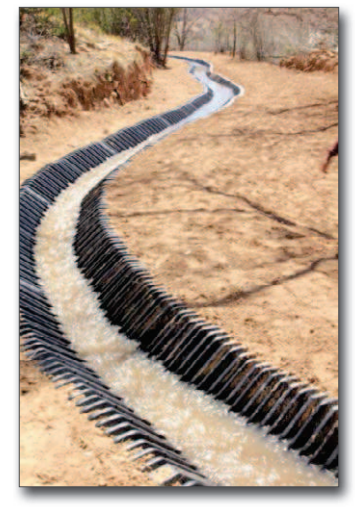
Figure 18. In-ground treatment ditch

used to line in-ground treatment ditches (Figure 18). They're a green product made of about 75% recycled material.