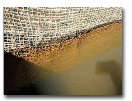
Figure 3. Matting used for floc collection

Floc collection becomes important if the stormwater runoff velocity is too high to allow the flocs to settle to the bottom. In these cases an attachment surface, such as the soft matting (jute, hemp, burlap, or coconut coir) shown in Figure 3, needs