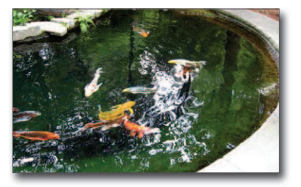
Figure 33. Coi pond two days later