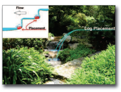
Figure 32. Polymer flocculant logs placed in the waterfall