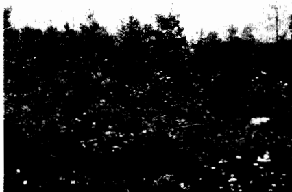
A reclaimed mining site showing trees for forestry purposes.

The LRC also voted to reduce the revegetation bond on 82 acres. This is the first year revegetation bonds have been reduced--in response to the five year revegetation bond holding provision that applies to mining permits issued by the Bureau since July 1, 1979. Revegetation bonds may be reduced after two growing seasons to an amount not less than fifty percent of the total revegetation bond amount if release criteria are met.