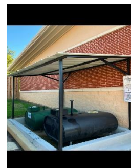
Brunswick Public Works

In 2024, 467,452 gallons of used oil and 31,134 gallons of used antifreeze were collected from Program sponsored locations. Additionally, during this period, 128 drums of used oil filters were collected for recycling.