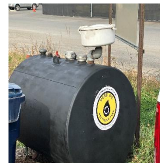
Penn Mar – Allegheny County

Good housekeeping is critical for spill control and to prevent contamination. As part of its management of the Program, MES has conducted on-site audits of all Program-sponsored collection facilities to ensure that sponsors, recycling coordinators, site supervisors, and site operational staff are aware of their pollution prevention responsibilities. Additionally, MES staff conducted routine cleaning and maintenance, as