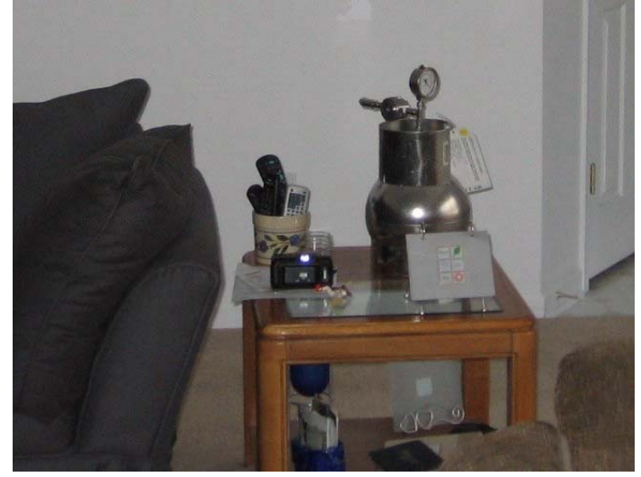
Indoor Air Samples Collected Using a Summa Canister

samples near the contamination site. In some cases, sampling closer to your property and/or home may be necessary. MDE does not usually recommend indoor air sampling for vapor intrusion during the early stages of an investigation. Indoor air quality changes a lot from day to day. Therefore, sampling one day may not show a problem even though sampling a day later might show contamination. Since a variety of