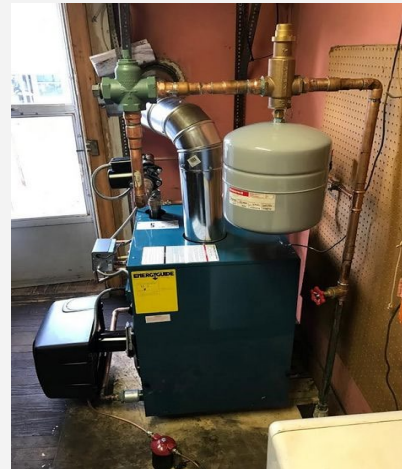
MEAP 2022 - Households with Vulnerable Populations