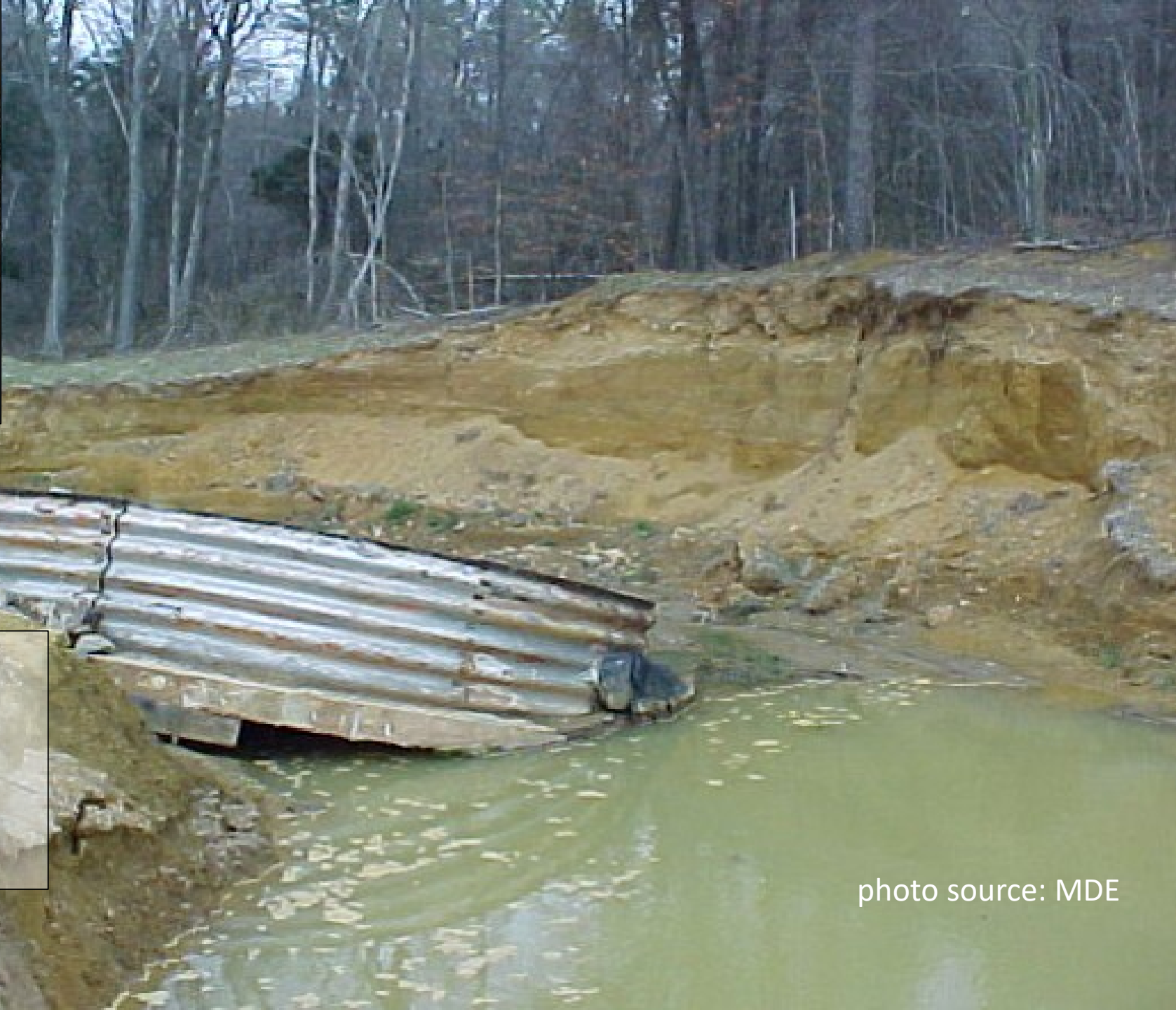
Stubbs Farm Dam Spillway Failure Kent County - 1999