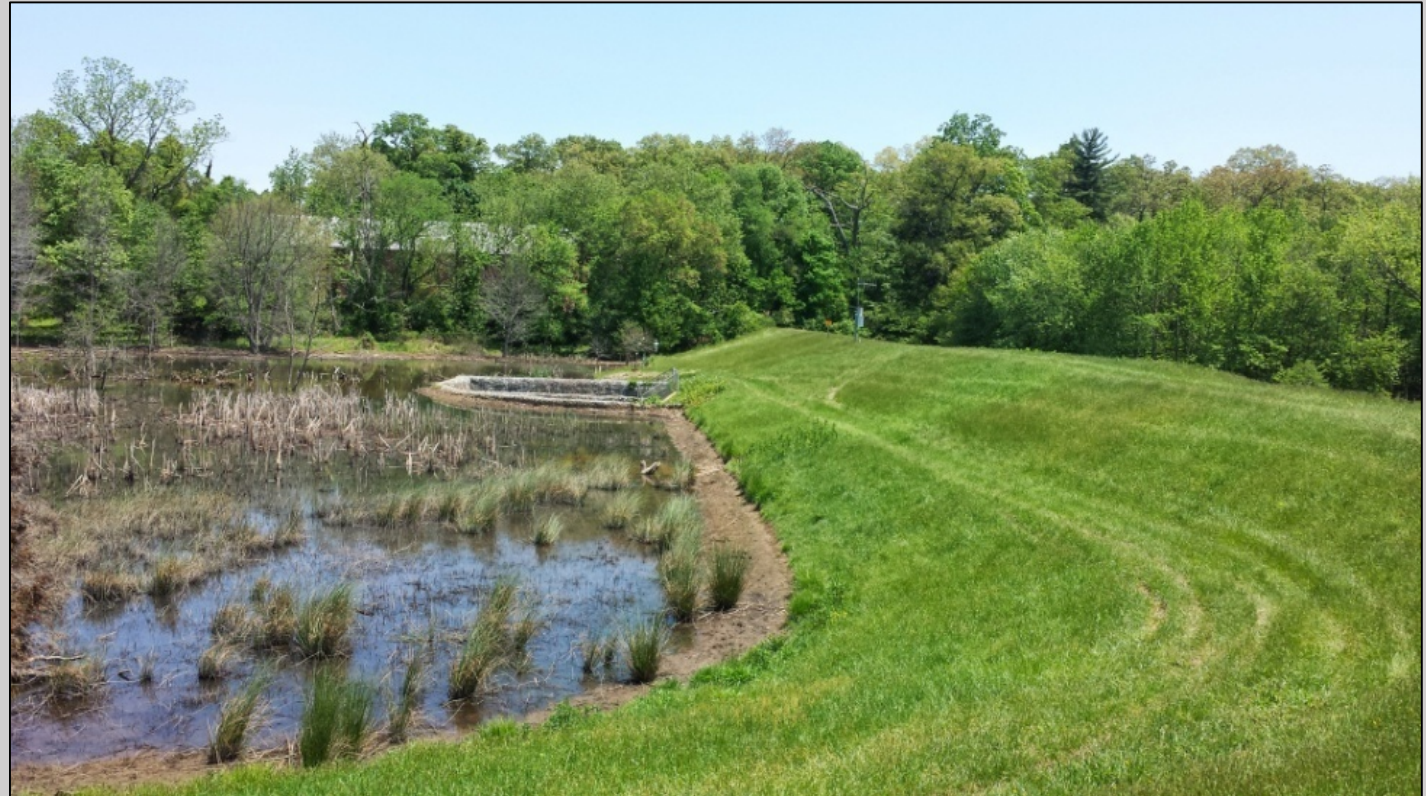
Henson Creek Regional Pond, Prince George's County