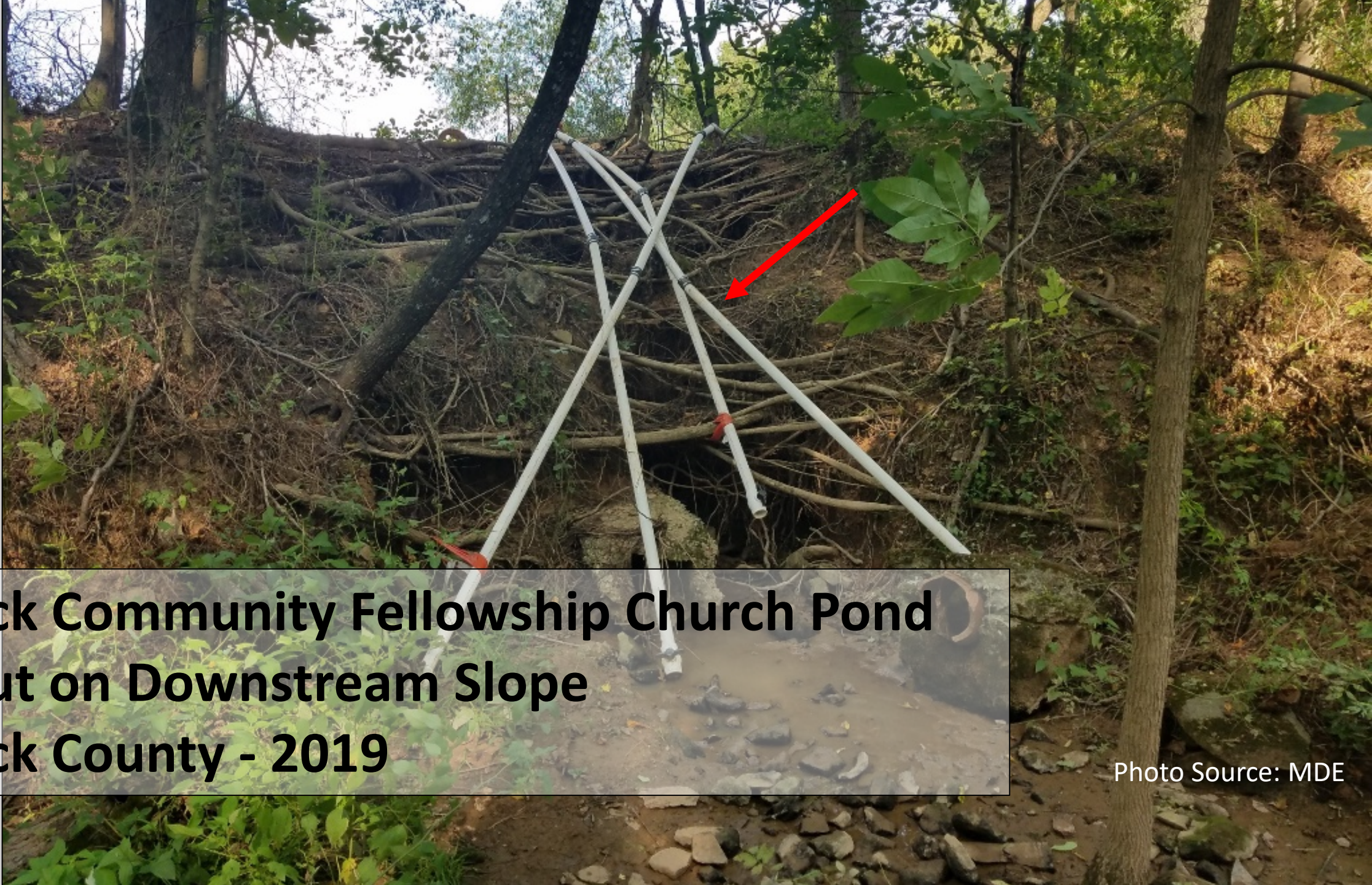
Frederick Community Fellowship Church Pond Head Cut on Downstream Slope Frederick County - 2019