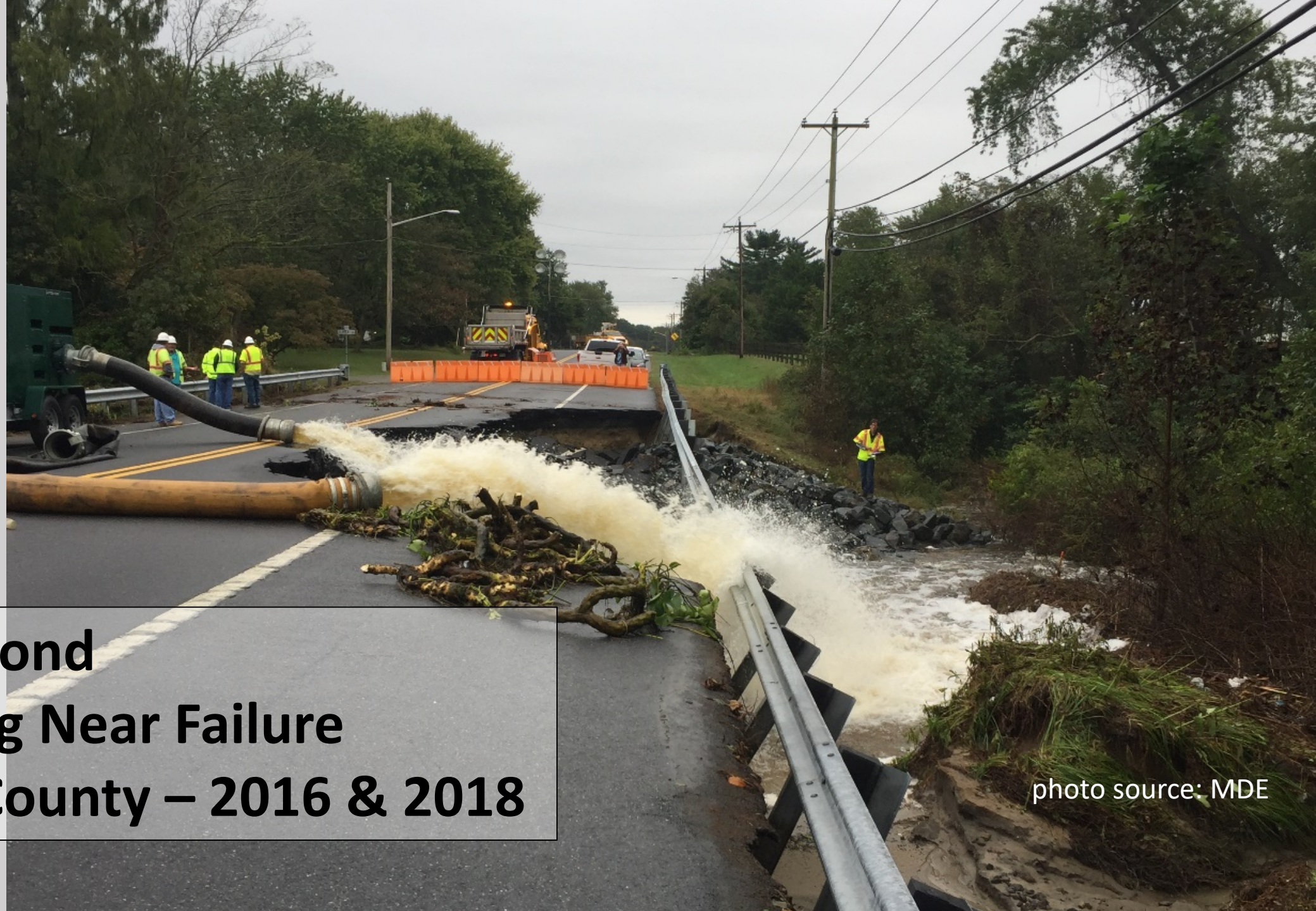
Riawalkin Pond Overtopping Near Failure Wicomico County – 2016 & 2018