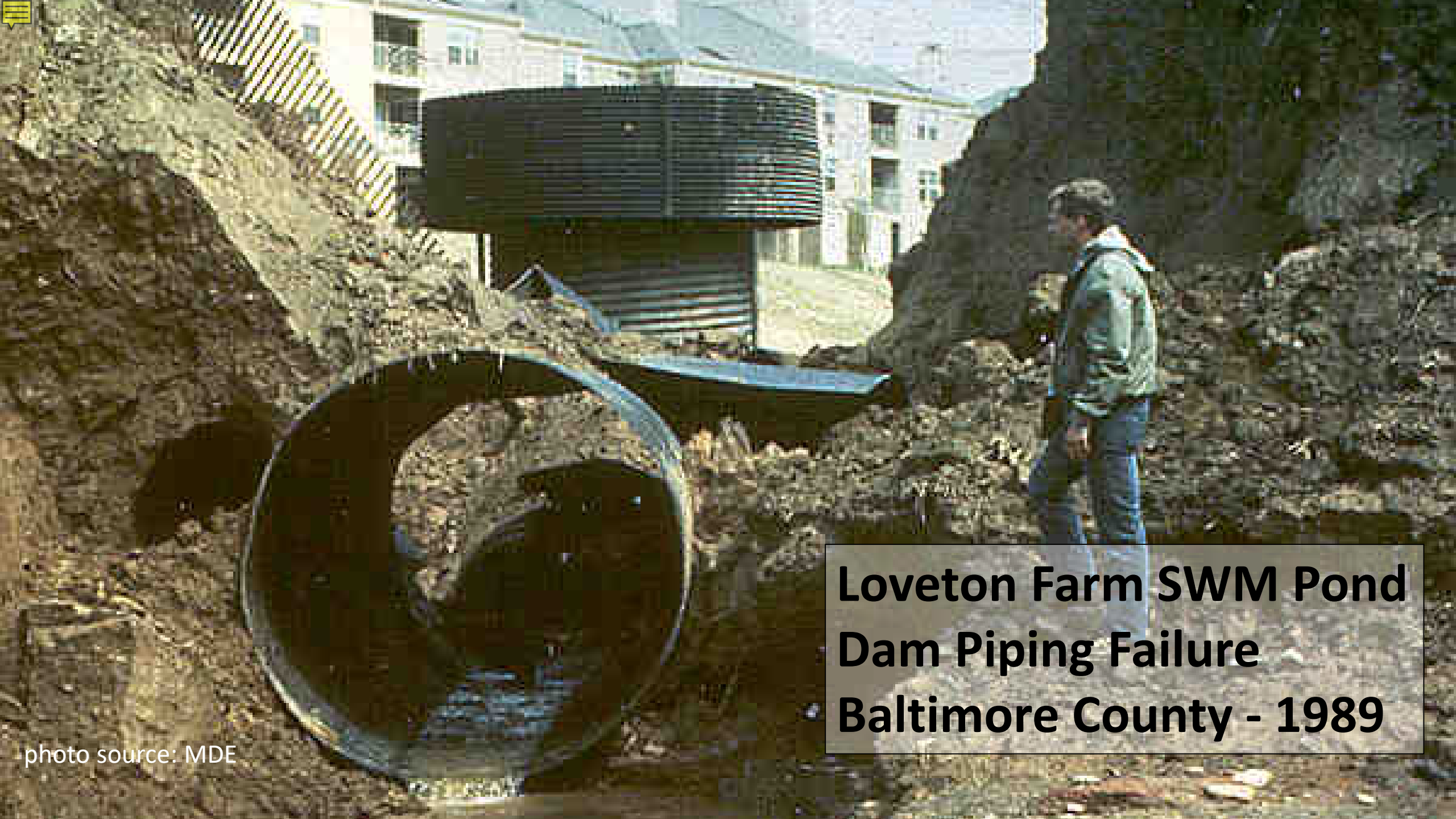
Loveton Farm SWM Pond Dam Piping Failure Baltimore County - 1989