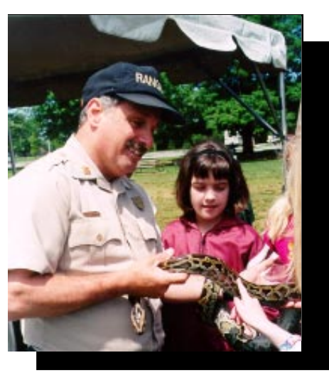
A DNR ranger explains the fine art of snake handling as part of a Scales and Tales exhibit.