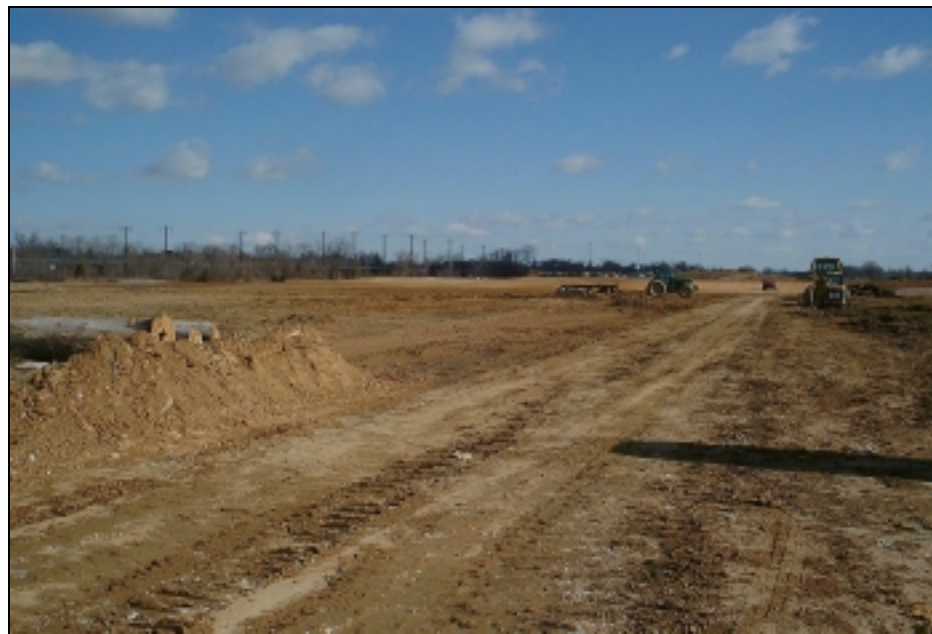
MDE ENVIRONMENT

Smart Growth legislation, passed in 1997, aims to save valuable natural resources, support existing neighborhoods and communities and save taxpayer money by avoiding costly infrastructure development required by sprawl. One of the key components of Smart Growth is the redevelopment of brownfields, which are unused or abandoned properties that are, or are perceived to be, contaminated. Maryland's brownfields law limits liability for redevelopers of old contaminated sites, and pro-