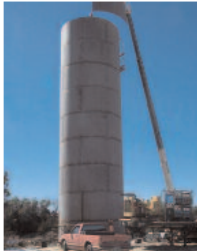
Possum Kingdom Water Supply Corporation, TX: Placement of the tenth ring for a Welded Steel Standpipe

water meters to quantify usage and to construct a reverse osmosis water treatment plant, reducing nitrates in the water supply from 11.28 mg/l to 0-2.5 mg/l. The project also established a laboratory, a record-keeping system, and additional operator training, which along with the new metering capabilities will improve the city's ability to finance and maintain the water system.