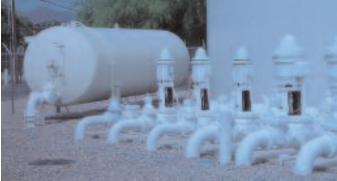
Flowing Wells Irrigation District, AZ: One of the community's wells where an arsenic treatment plant was constructed