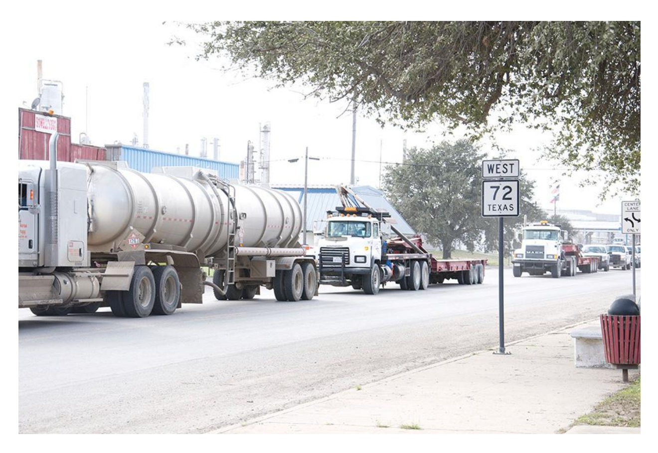
Figure 1. Trucks associated with oil and gas extraction operations in Texas (TX DOT 2014).

In addition to the associated increase in costs, inconveniences, and concerns for safety, local vehicle response and public safety services may need to increase their capacities to respond. This includes ambulances, fire trucks, and police cars. Finally, greater need for traffic control may lead to required installation of additional traffic signals, signage, and turn lanes (NYSDEC, 2011).