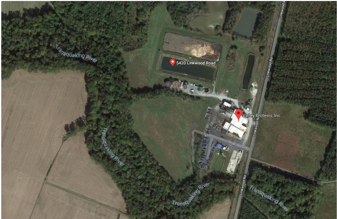
Figure 1: Aerial Photo of Valley Proteins Site

The application being processed consists of an original application plus two (2) application amendments. Valley Proteins submitted an application on June 1, 2004, for renewal of a permit to discharge an average of 150,000 gallons per day of treated process wastewater from a poultry rendering facility. This application was identified and tracked as 04-DP-0024. On May 5, 2014, the applicant submitted a permit modification request to increase discharge from an average of 150,000 gallons per day to 575,000 gallons per day of treated process wastewater. The Department acknowledged receipt of this request as a separate modification application, numbered 04-DP-0024A. Subsequently, this application has been combined into the original 04DP0024 application as an amendment. Application 04-DP-0024A is thus no longer being considered. On September 17, 2015 Valley Proteins requested another modification to their application. They requested the inclusion of a Vehicle Maintenance Building which will include a truck wash area. All requests were combined into one application now to be called 04-DP-0024.