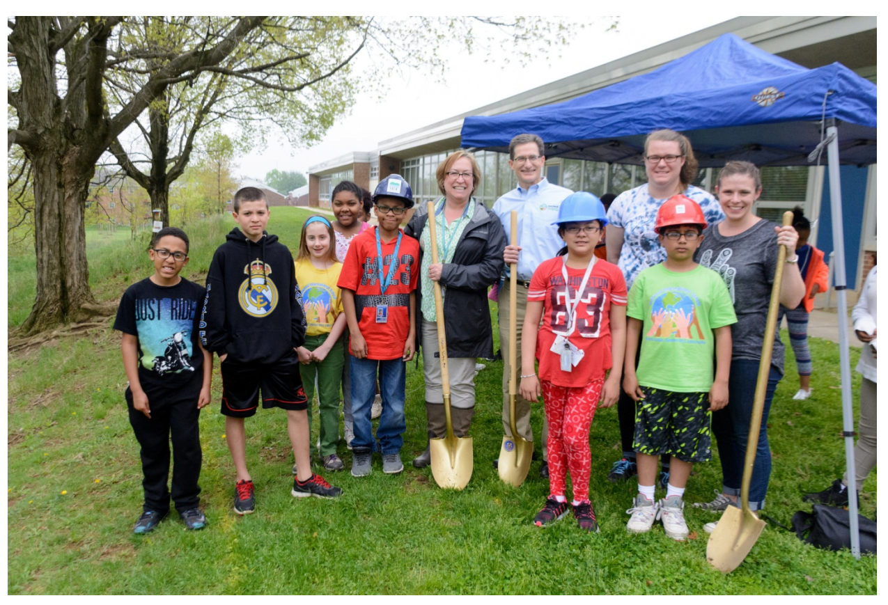
<u>Involving Customers of All Ages</u>

- "Hogan VIP Regs: Clean Air, Less Hassle", Baltimore Sun, July 31, 2017.