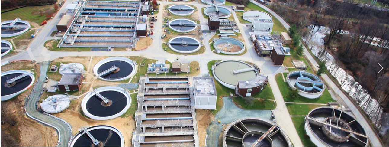
Figure 1 - Little Patuxent Water Reclamation Plant – 25 MGD, ENR Upgrade

The table also shows that for each WWTP, the percentages of connections of improved parcels inside PFAs before and after ENR upgrades are very similar, within a few percentage points in every case. Compare column "E" to column "H".