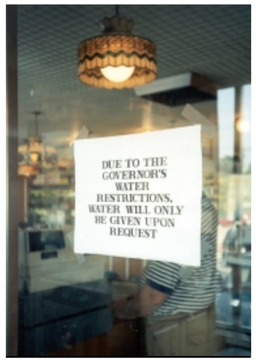
Towson's Bel-Loc Diner is just one of many businesses cooperating with drought restrictions.