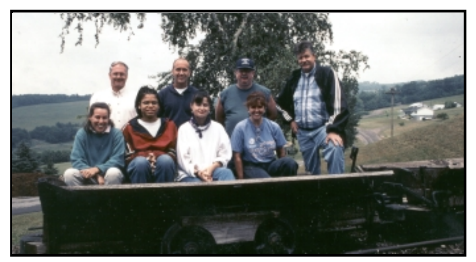
MDE staff and task group members on a learning field trip to a local mine.

MSDE assembled a talented group of four teachers to take on the writing task. Staff from MDE took the teachers on tours of a coal mine, tworock quarries and a sand and gravel mine. Familiarizing the teachers with the mining process and all of the uses of mined products was thought to be the best way to help them focus on the lesson plans. The teachers had a terrific time and asked lots of questions of the industry representatives. They then spent a week writing the draft of the lesson