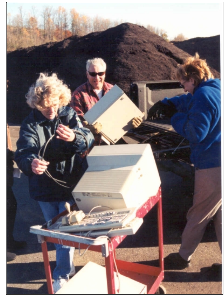
MDENVIRONMENT ft works to sort some of the e-cyclables

Call (800) 633-6101, extension 3314 to find out if an eCycling collection is being scheduled near you. Or go to MDE's website at: www.mde.state.md.us and scroll down to the eCycling link to find out more.