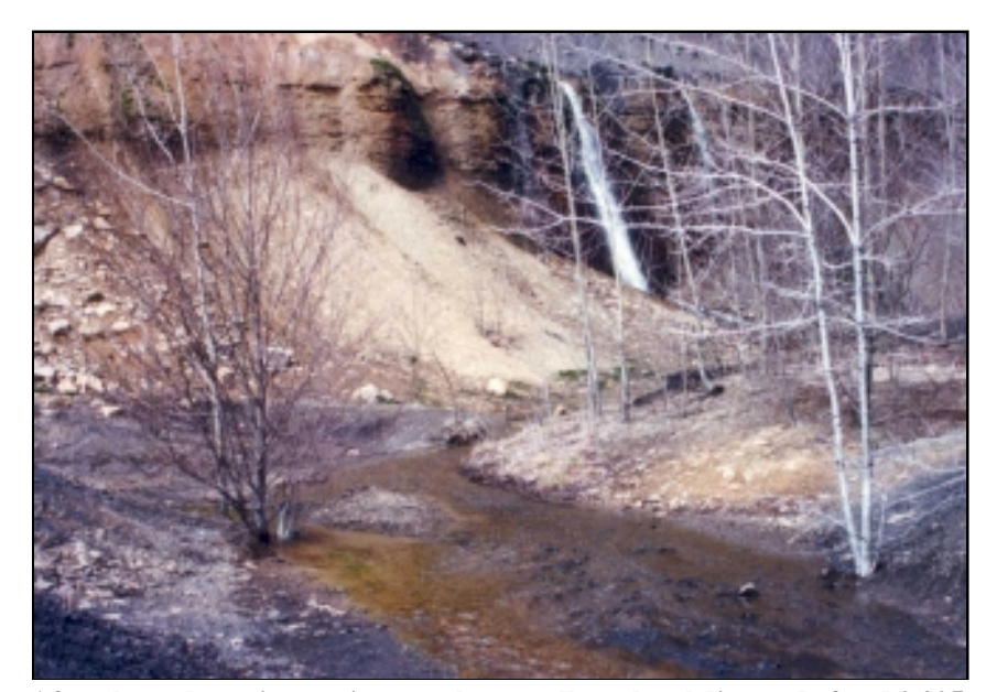
After the reclamation project, trash was collected and disposed of and 2,325 linear feet of impacted stream channel reconstructed and armored. The stream, shown above, was restored by workers from MDE.