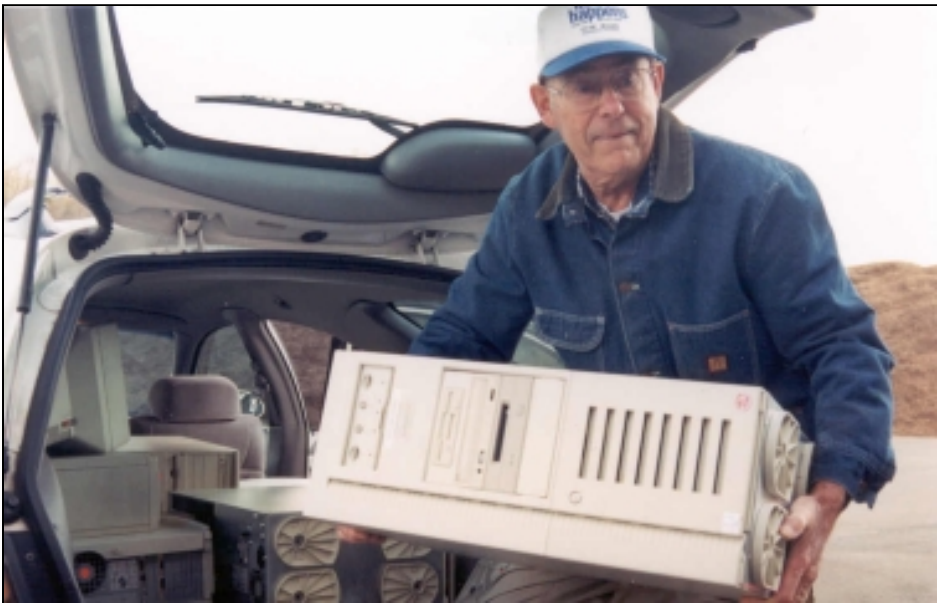
MDENVIRONMENT

In an effort to provide a long-term solution, EPA in conjunction with Maryland and its sister agencies in Pennsylvania, Delaware, Virginia, West Virginia, and the District of Columbia and the electronics industry launched eCycling , the region's