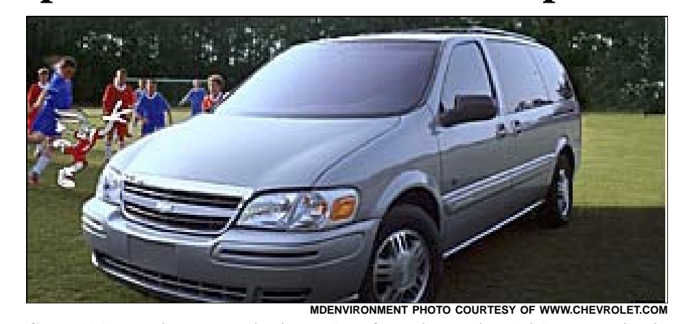
General Motors will soon be using its new lead-free primer paint, which was unveiled in August, on all of the cars in its fleet including the new Chevrolet Venture mini van, shown above.

By introducing lead-free primer paint, GM