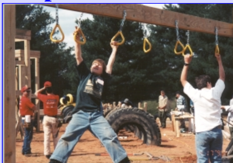
Boy Scout volunteers testing the newly built playground equipment.

Tire chips from approximately 2,500 shredded scrap tires were placed under playground apparatus as a safety