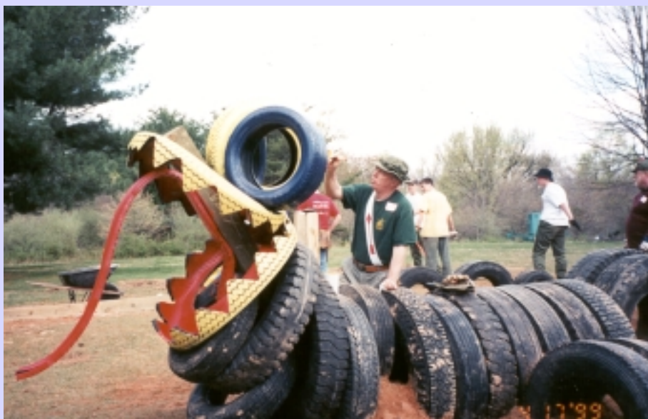
A local Boy Scout Troop Leader puts the finishing touches on the tire monster.

This is Maryland's seventh scrap tire playground and is expected to be a great asset to the community bringing visitors back to the park. MDE has plans to build another one of these extremely popular scrap tire playgrounds at Elk Neck State Park in Fiscal Year 2000.