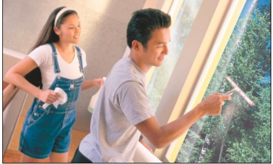
MDE Photo Courtesy of ARA

Another way to change and improve the appearance of a home is to refinish wood floors or replace carpeting. Staining and fin-