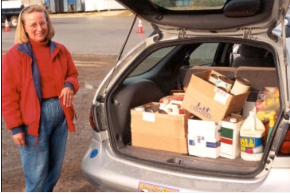
An Eastern Shore resident turns in boxes of household chemicals to be disposed of

"This is the greatest thing since sliced