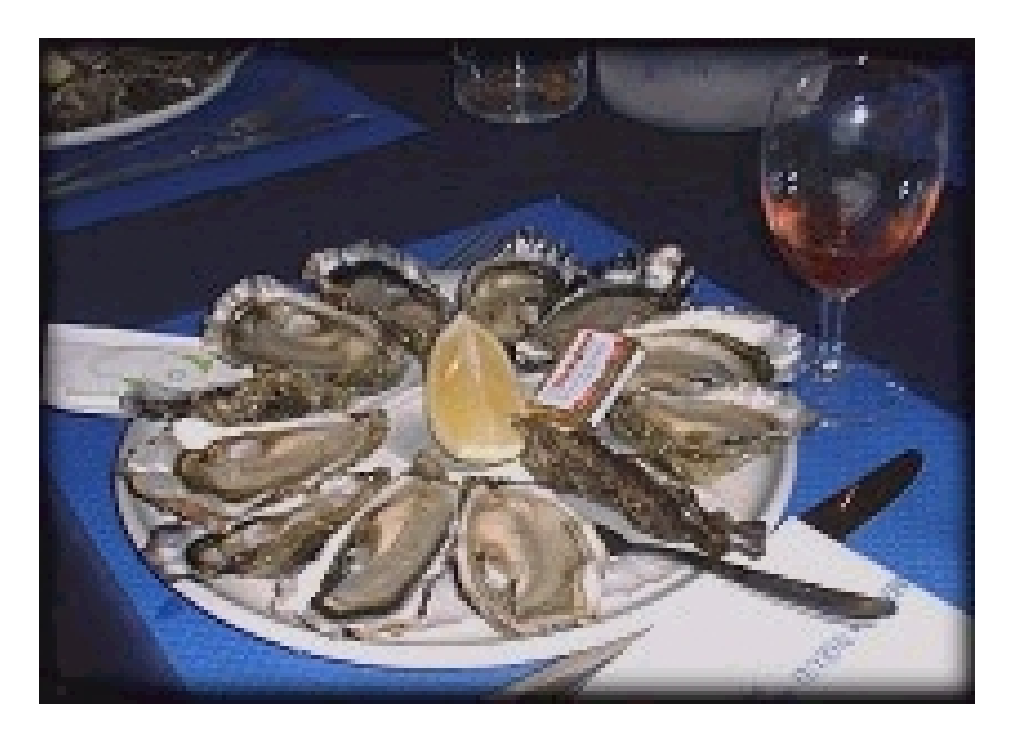
Shellfish taken from approved waters, properly inspected and prepared pose no threat to consumers.

Consumption of raw or partially cooked oysters creates a risk of illness to certain individuals with predisposed medical conditions. People at "high risk" include those who have liver disease, excessive alcohol intake, diabetes, AIDS or HIV infection, stomach disorders, inflammatory bowel disease, cancer, abnormal iron metabolism, steroid dependency or any illness or medical treatment which results in a compromised immune system. Older adults are more likely