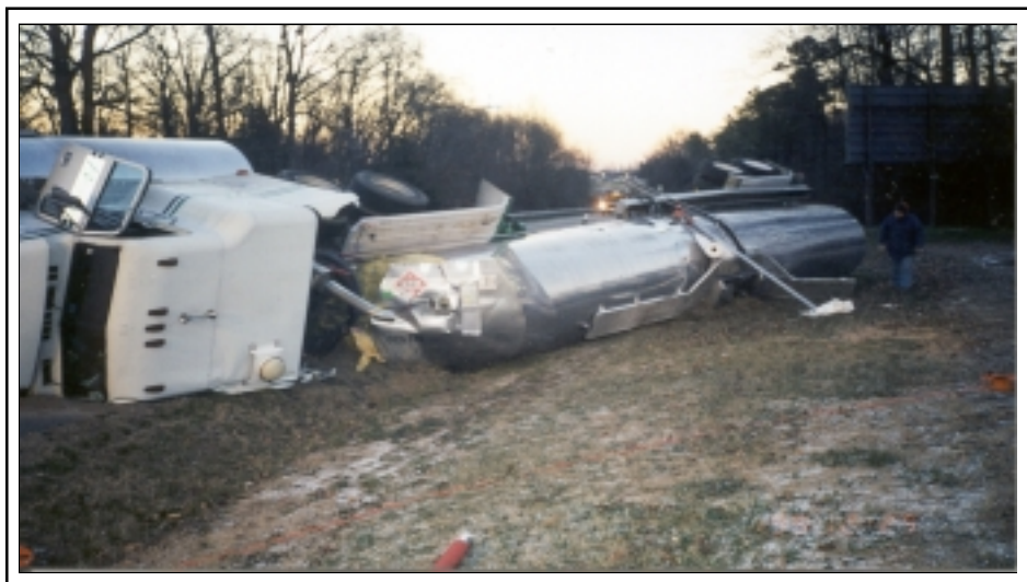
Above is an overturned tanker truck containing a combustible resin that tipped over on MD Route 404 in Denton on Dec. 29. This accident led to another that resulted in a death.

In a session entitled, "Fishing for Community Involvement," participants learned about strategies that can