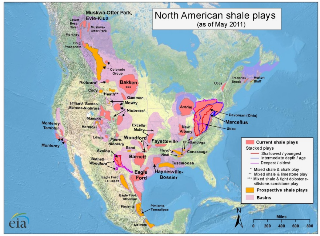
Source: U.S. Energy Information Administration based on data from various published studies. Canada and Mexico plays from ARI. Updated: May 9, 2011

Domestic production of shale gas also has the potential over time to reduce dependence on imported oil for the United States. International shale gas production will increase the diversity of supply for other nations. Both these developments offer important national security benefits.<sup>2</sup>